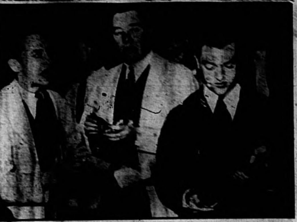
Confusion and hectic moment of 1938 accompanied heavy selling and falling prices in United States stock exchanges. But after a quiet session, prices staged a comeback and regained some of their losses. Here's a scene in the Chicago stock exchange during the hectic trading.