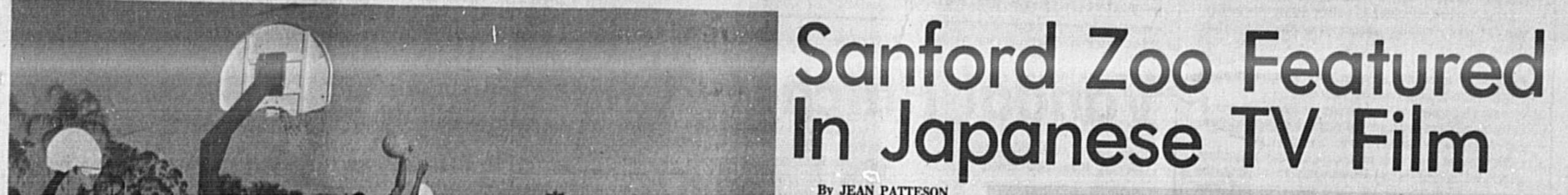
Japanese viewers will soon see the old Sanford Zoo featured in the television special, "A Day in the Life of Stan Brock"