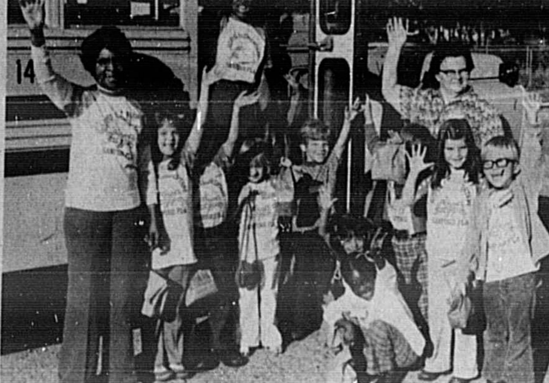
They're off for sea world. Wednesday was a big day for Hopper Elementary School pupils, kindergarten through third grade, as they boarded school buses for a field trip to Sea World near Orlando.

He said the oil companies are raking in record profits. Several plans have been proposed to cut off profits and revenues.