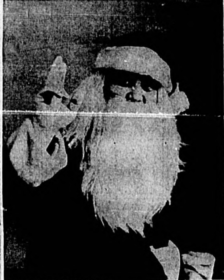
SANTA CLAUS SENT his own personal picture to The Sanford Herald so that children might be assured he will be here tomorrow afternoon at 4 o'clock to take part in the big Jaycee-Sanford Merchants Association Parade.