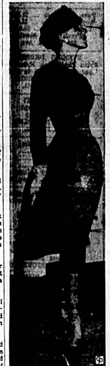
TAFETA AND CREPE are combined for this afternoon dress from the collection designed by Beni Claire. A monotone in royal blue, the dress is beltless and slim, with a fly-away back panel stiffened with taffeta lining.