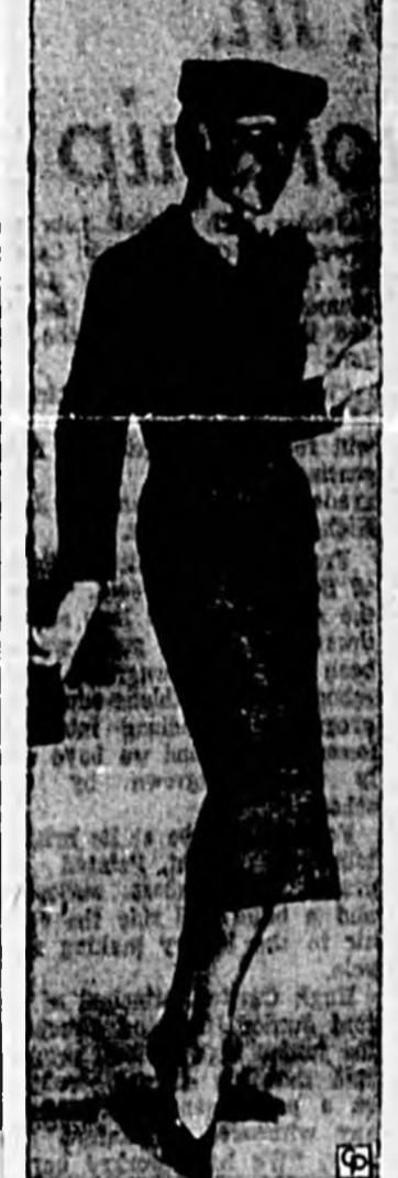
SLIGHTLY-FITTED SUIT a gray and white novelty silk-wed, comes from Harry Frechlich's collection. The jacket has a double-breasted closing with black bone buttons. A red silk rose is worn on the flat shawl collar.