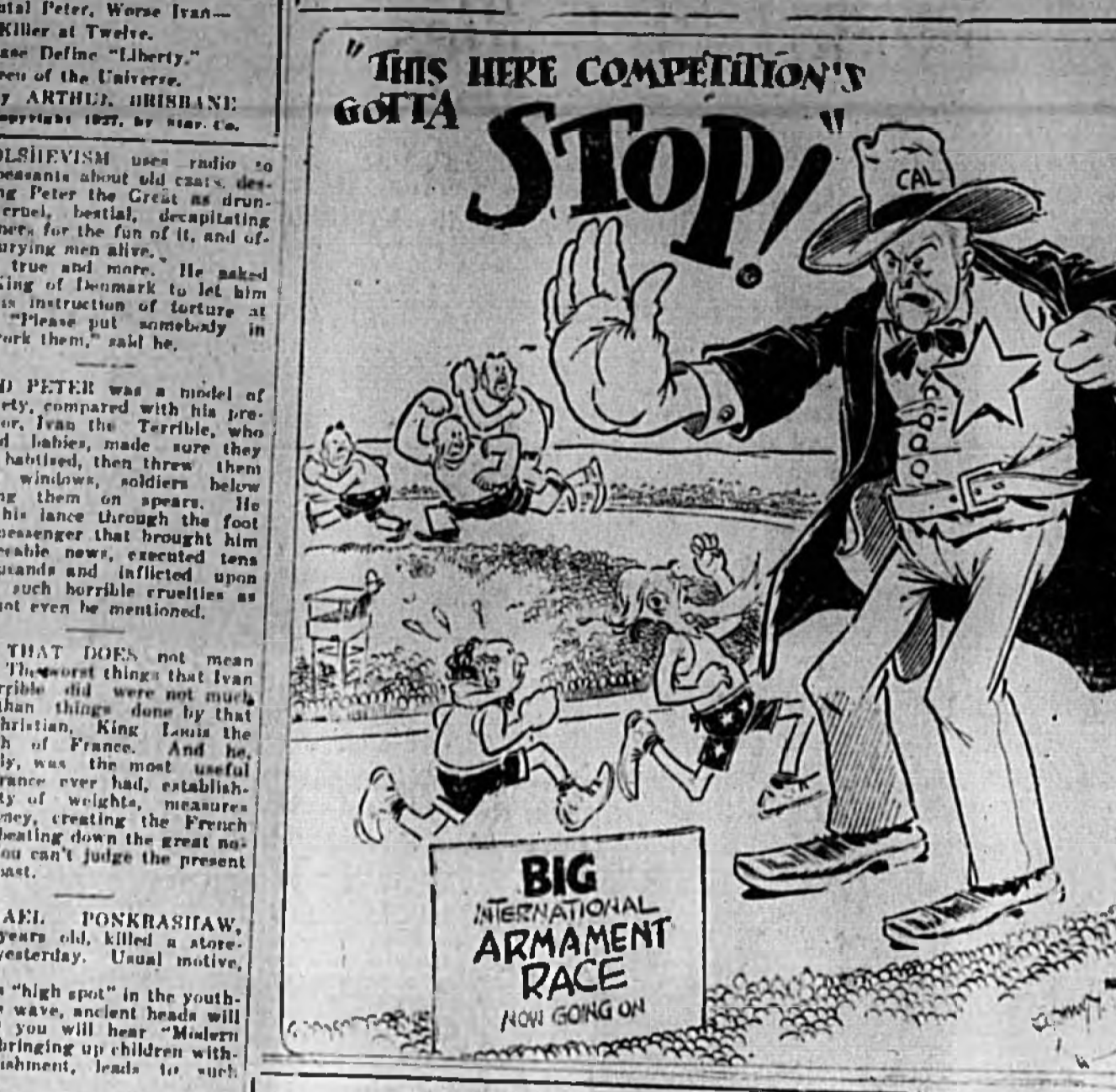
THIS HERE COMPETITION'S GOTTA BE THE BEST

Along the south Atlantic coast the wind will be gusty with occasional showers. The weather will be clear.