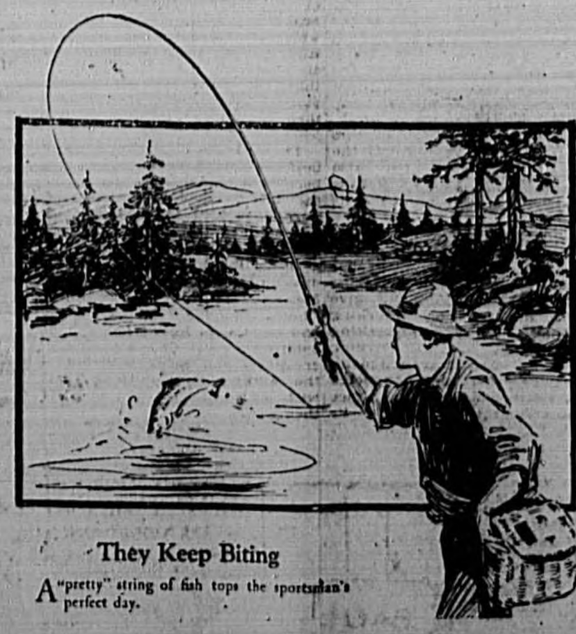
They Keep Biting A "pretty" string of fish tops the sportsman's perfect day.

Fourth Annual FISHING CONTEST STARTS THURSDAY, MAY 1ST AND WILL EXTEND TO OCT. 1ST. THIS CONTEST HAS ALWAYS PROVEN POPULAR AND ATTRACTED MUCH INTEREST AND WE HOPE WILL THIS YEAR ENLIST A LARGE NUMBER OF LOVERS OF THIS FORM OF SPORT. FROM ALL REPORTS THE STREAMS ARE FULL OF FISH, "BETTER THAN EVER." AT OUR STORE MAY BE FOUND COMPLETE LINE OF THE LEADING BRANDS OF FISHING TACKLE AND EQUIPMENT. THE PUBLIC IS CORDIALLY INVITED TO COME IN AND TALK IT OVER.