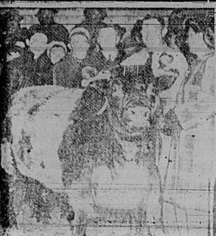
WINNER OF THE GRAND CHAMPIONSHIP in the award at Chicago market fourth annual stock show. Tomhawk, 1100 pure-bred Spotted Poland chickens and 7000 pure-bred Rhode Island Reds (right) of Thornton, Iowa, a former 4-H member. The show was in conjunction with the national 4-H Club Congress.