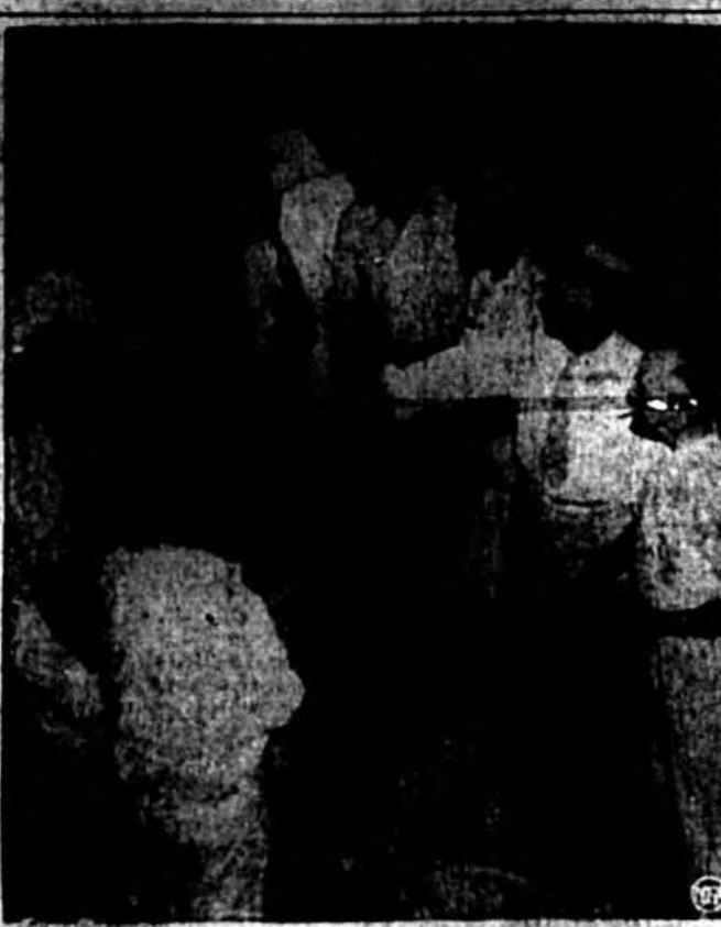
To the bright leaf tobacco markets of South Georgia flocked farmers and buyers as the sing-song chant of auctioneers heralded the annual auction of the "golden weed." Early arrivals among the buyers are shown above getting a preview of the crop before opening of the market at Valdosta.