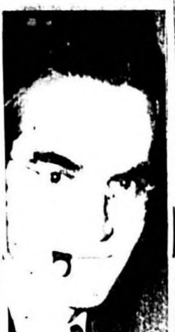
THERE'S BEEN hot campaigning for the Fifth Tennessee congressional district nomination...