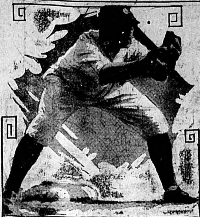
Here's Cleveland's new third baseman, Johnny Hodapp, who got away to a good start in his major league debut the other day.

ALL PROPERTY OWNERS OWNING PROPERTY ON THE FOLLOWING STREETS: MELLONVILLE AVE FROM PACE LANE NORTH TO THE NORTH LINE OF MAYFAIR; ELIOTT AVE. FROM PACE LANE NORTH TO OPPOSITE THE NORTH EAST CORNER OF LOT 13 BLOCK 1, OF MAYFAIR; SUMMERLIN AVE. FROM PACE LANE NORTH TO OPPOSITE THE NORTH EAST CORNER OF LOT 14, BLOCK 2 OF MAYFAIR, AND UNION AVE FROM MELLONVILLE AVE EAST TO SUMMERLIN AVE. 24 FEET IN WIDTH WITH A 5" ROCK BASE SURFACED WITH ASPHALT.