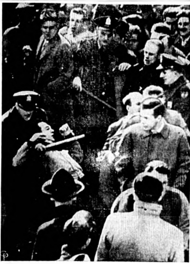
WHILE TRYING TO BREAK INTO a picket line blocking the entrance to a Philadelphia telephone exchange, one of the striking C.I.O. Communications Workers is collared by a policeman. Other officers ring around, holding back the crowds and keeping a lane open for non-striking operators trying to get to their jobs.