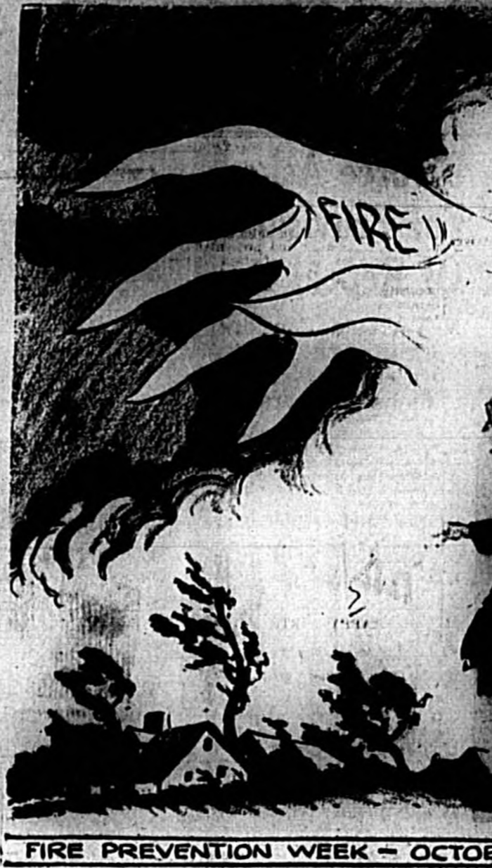
FIRE PREVENTION WEEK - OCTOBER 8th TO 14th