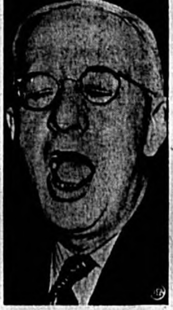
Former Governor of New York Alfred E. Smith, whom President Roosevelt christened "The Happy Warrior," is pictured in the photograph above.