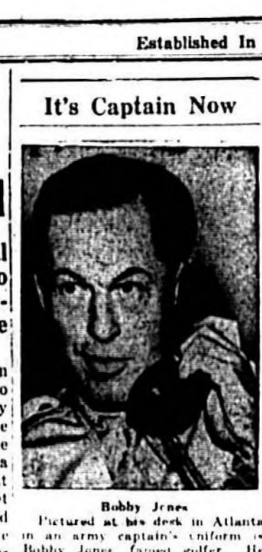
Portrait of a man in a military uniform.