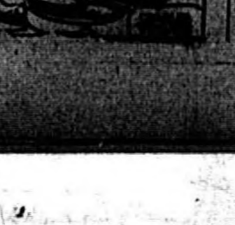
COMING ON SILVER!