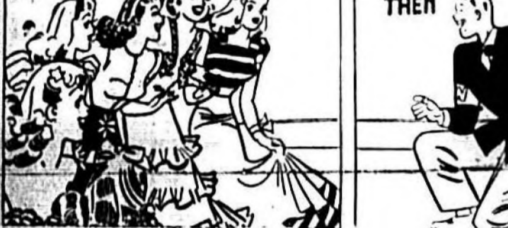
THE DEMOLITION SQUAD