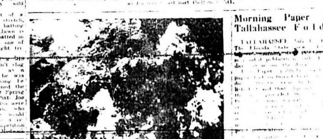
The crowd gathered for the opening of the season in the stadium of the Atlantic Coast Conference.