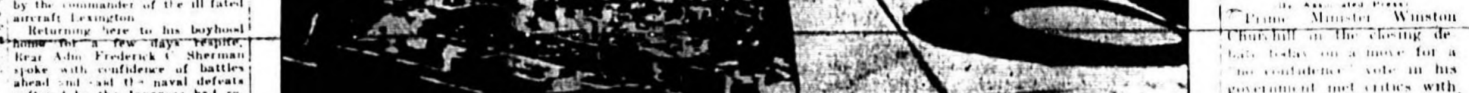
RAF Skims Near Eiffel Tower To Honor 1918-19 Hero

RAF Skims Near Eiffel Tower To Honor 1918-19 Hero Churchill in House of Commons Tells House of Commons that the Middle East situation is the worst blow since the fall of France. Churchill stated that the situation in the Middle East is the most serious since the fall of France. He said that the British forces in the Middle East are being stretched to the limit.