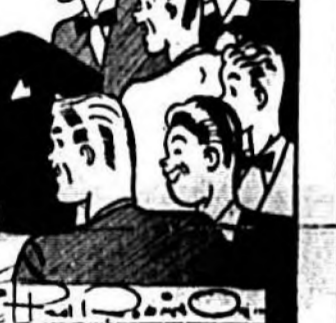
COMING ON SILVER!