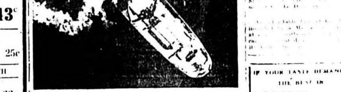
The picture which comes from the ...