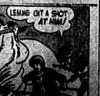
COMING ON SILVER!