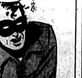
COMING ON SILVER!