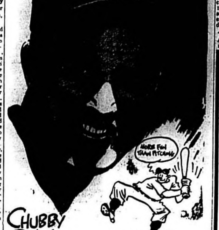
CHUBBY DEAN, FORMER PHILADELPHIA ATHLETIC, HITTING PITCHER FOR THE RED SOX.