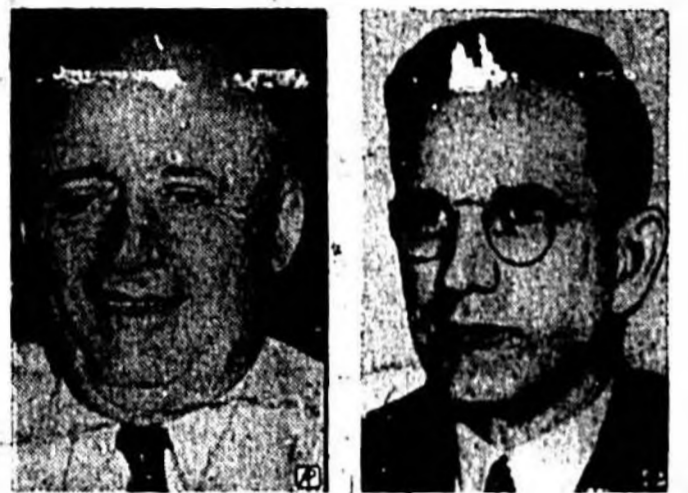
House of Representatives Speaker Sam Rayburn of Texas (left) who was re-elected to that post and Rep. John W. McCormack of Massachusetts who was re-elected majority leader as the Democrats got together with the hope that their control over the chamber will not be jeopardized by the strengthened Republican bloc.