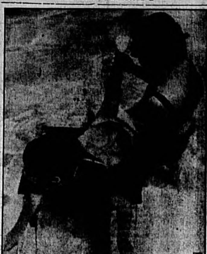
Physio-Therapy is the technical name for one of the treatments of patients recovering from paralysis. At Warm Springs, Ga., famed center for combating the disease, this child slowly regains the use of his limbs, buoyed up by the 88-degree water of the swimming pool.