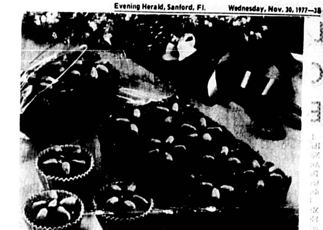
NO BAKE FRUITCAKE IDEAL GIFT

Chanukah is a time of happiness and good will. It is one of the most joyful Jewish holidays and its customs are similar to those of Christmas—giving gifts, lighting candles, decorating the home—but yet distinctly Jewish in flavor. This year Chanukah celebrations will begin on December 5. Candles will be lit each night for eight days to commemorate the rekindling of the lights of the Temple when the holy place was rededicated after the Maccabean warriors had recaptured it from the Syrians. Food is an important part of any holiday celebration and Chanukah is no exception. Suggested here are three kinds of latkes or pancakes which are traditional for the Chanukah season. These delicious pancakes are fried in peanut oil and served with appropriate garnishes.