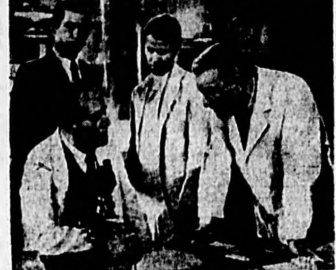
EDDIE ALBERT, right, tells off Frederic March in a scene from "The Young Doctors" while Ben Gazzara and Dick Clark look on.

"Ben-Hur," one of the greatest of Motion Picture Arts and Sciences, "Ben-Hur" also won the British "Oscar," was named Best Film of the Year by the New York Film Critics, Best Produced Film of the Year by the Screen Producers Guild, and has been given a long list of additional awards and citations.