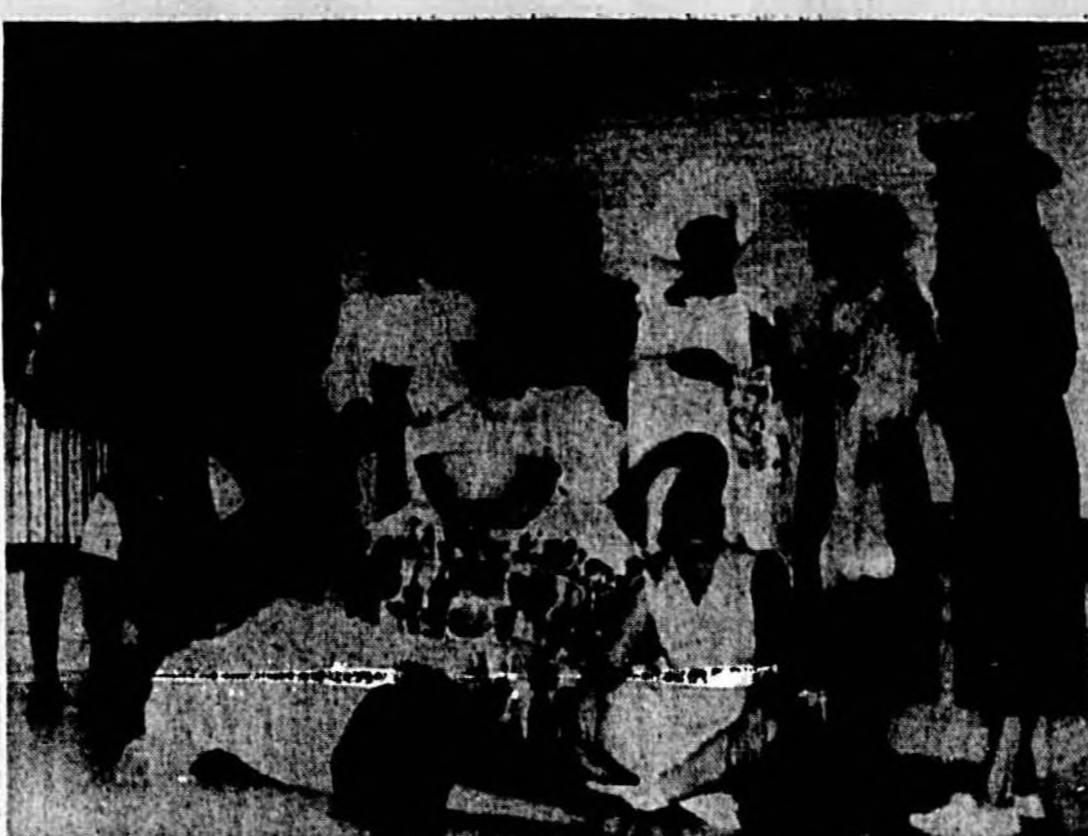
YOUNG AT HEART WORKERS at Seminole High School luncheon got right into the spirit of Halloween Tuesday, using their imaginations to create some ingenious costumes in which to greet the students for the noon meal.