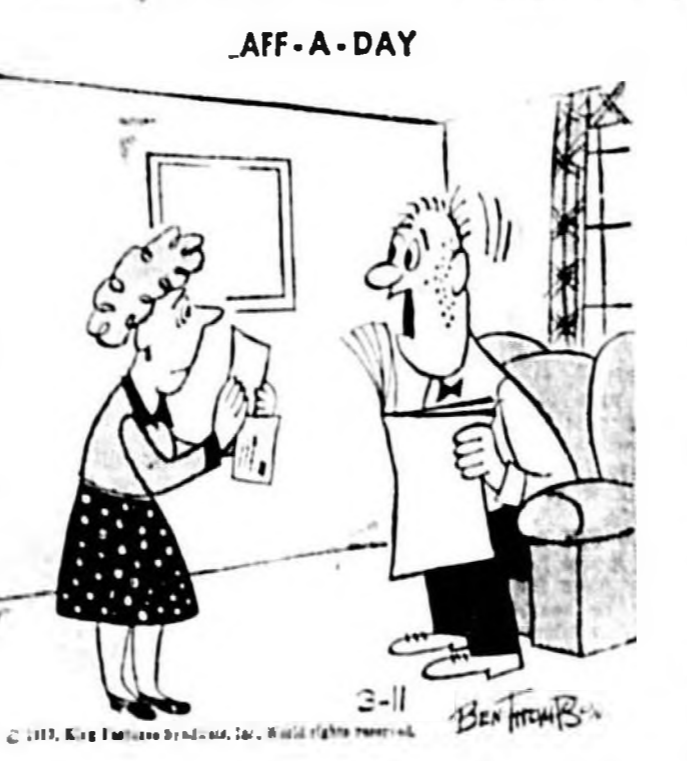
"YOU won a contest in twenty-five words, or less."