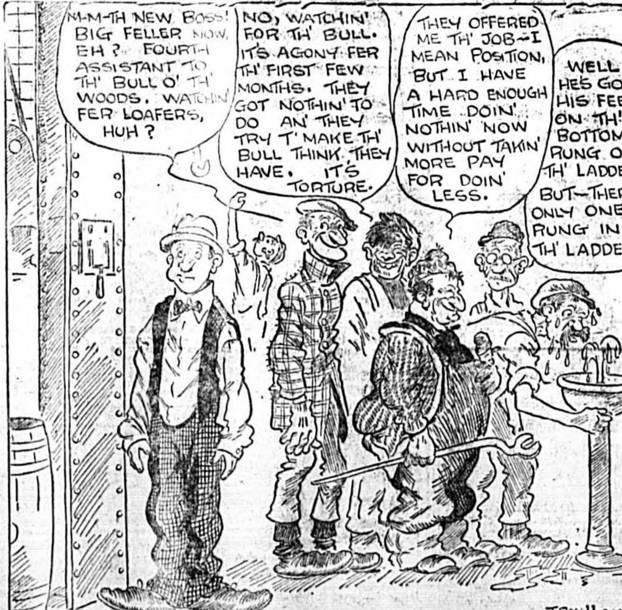
UNEASY LOAFERS THE CROCK WITH A CROWN. J.R. WILLIAMS