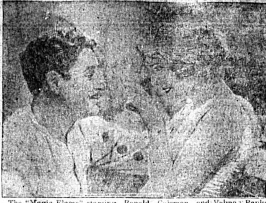
The "Magic Flame" starring Ronald Colman and Vilma Banky will be exhibited here on Monday night. It is declared one of the best films that have been seen here for some time.