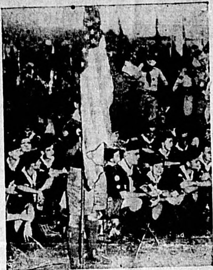
AMERICAN SCOUTS attending the International Jamboree in Karuzawa, 100 miles north of Tokyo, assemble after flag-raising ceremonies. Scouts from nine countries were on hand. (International)