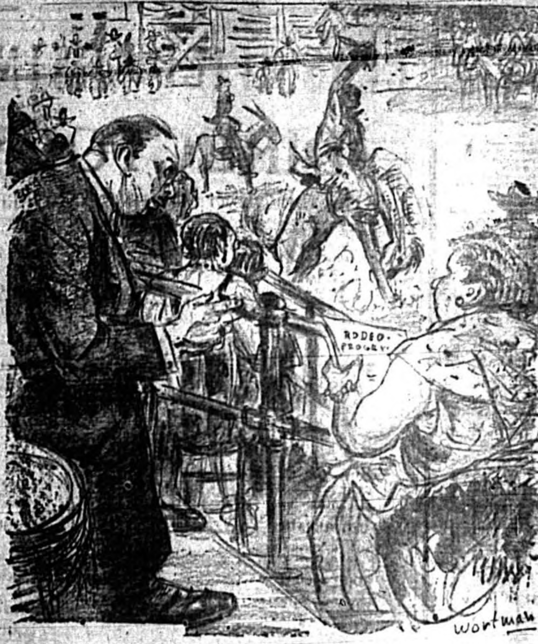
"Jasper, I think some exercise like that would be good for you"