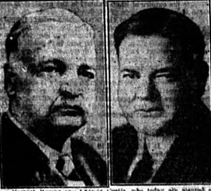
Herbert Hoover and Charles Curtis, who today also appeared of the greatest victory ever won by presidential and vice-presidential candidates since the day when George Washington was unanimously elected as first president of the United States! They beat Alfred E. Smith and Joe Robinson, the Democratic nominees.