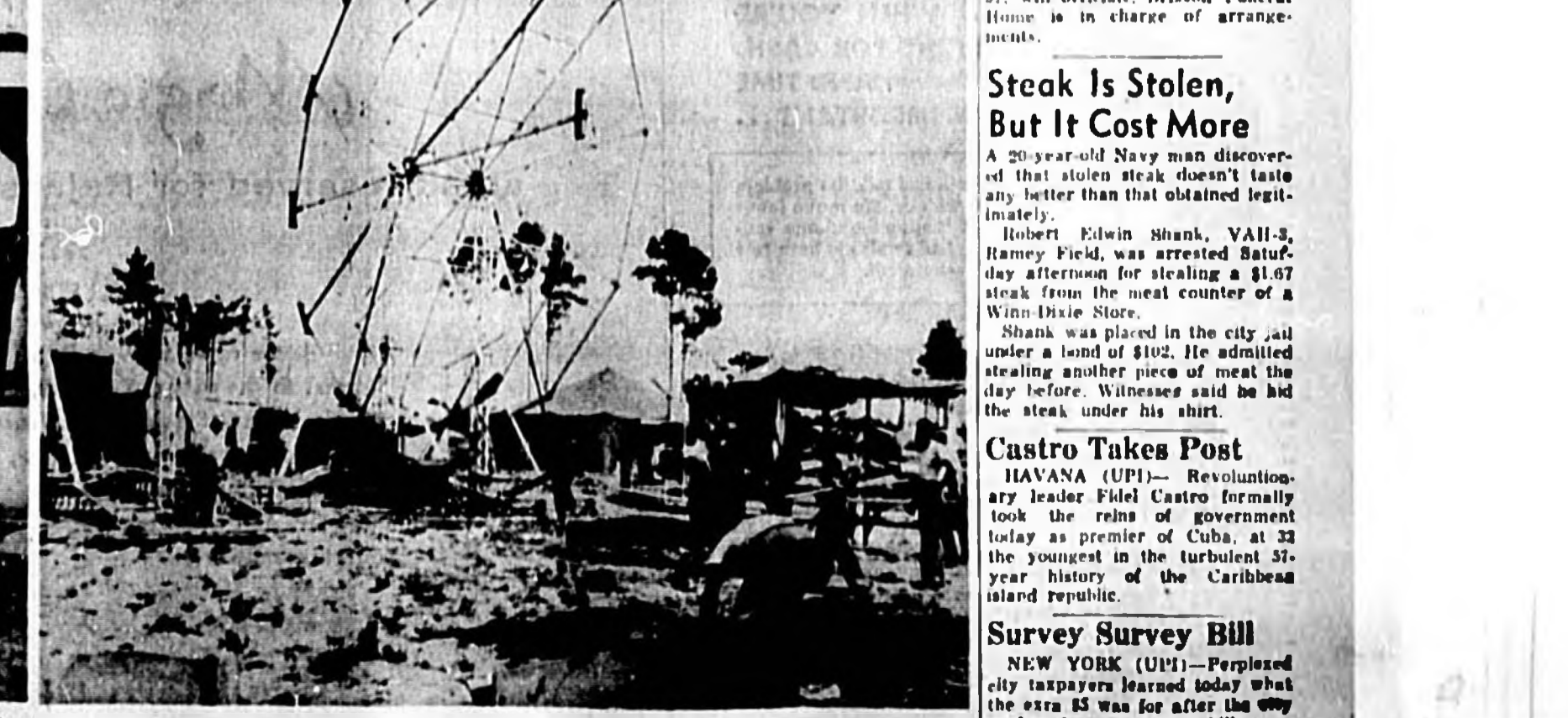
FERRIS WHEEL GOES UP — and tonight opened at 4:30 this afternoon with dedication ceremonies for the commercial exhibit of the American Legion Fair. The fair building.