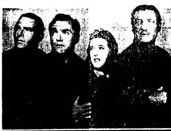
Group photo of people at a social gathering.