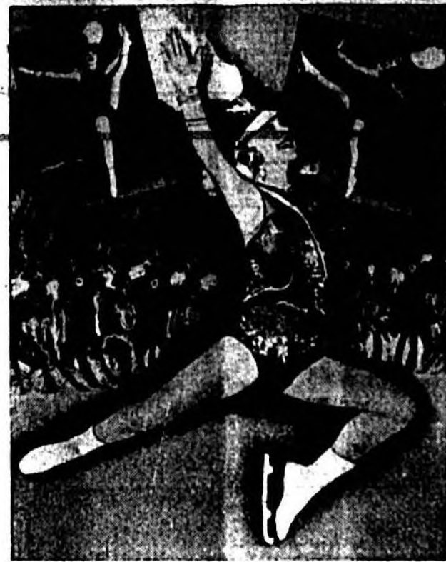
Never before in her brilliant career has charming Sonja Henie performed such breath-taking swirls and spins on ice as she does in her latest screen hit, 20th Century Fox's gay new musical, "Ice-land," coming to the Ritz Theatre Sunday and Monday. Sonja dances her way into the heart of co-star John Payne, when he lands in her native Iceland. Jack Oakie and Sammy Kaye and his Orchestra are featured in the film.

NEW TISSUE BOX Where to put your facial tissues? You wouldn't tuck them out of sight if you had a tissue container that would add charm to your study or bathroom. One cosmetic firm has come out with just that, and packed the lovely box brimful with spicy soap and talcum.