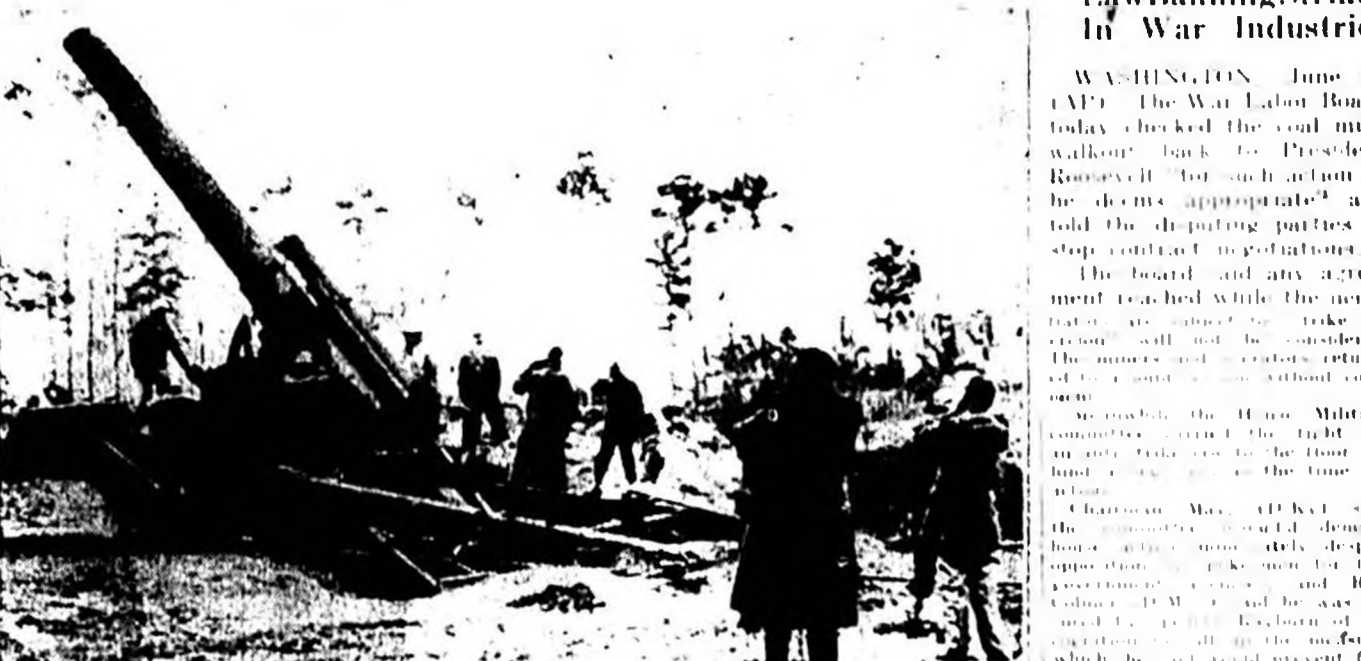
ARTILLERY OFFICERS PREPARE TO FIRE the new 210 mm. howitzer, a powerful and accurate gun, according to the United States Army.

Plans Are Made For Celebration On July Fourth