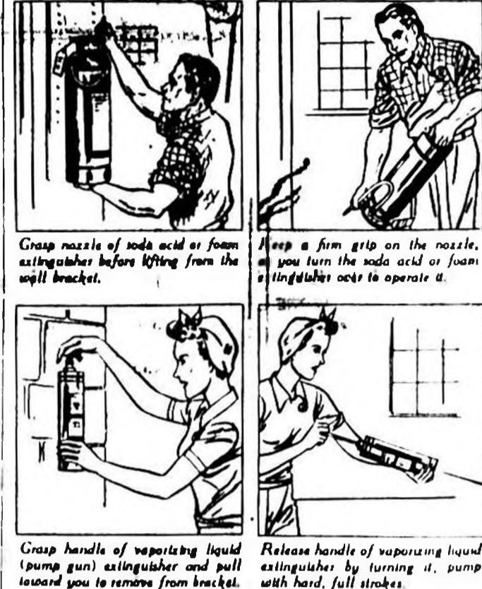
Grasp nozzle of soda acid or foam extinguisher before lifting from the wall bracket.