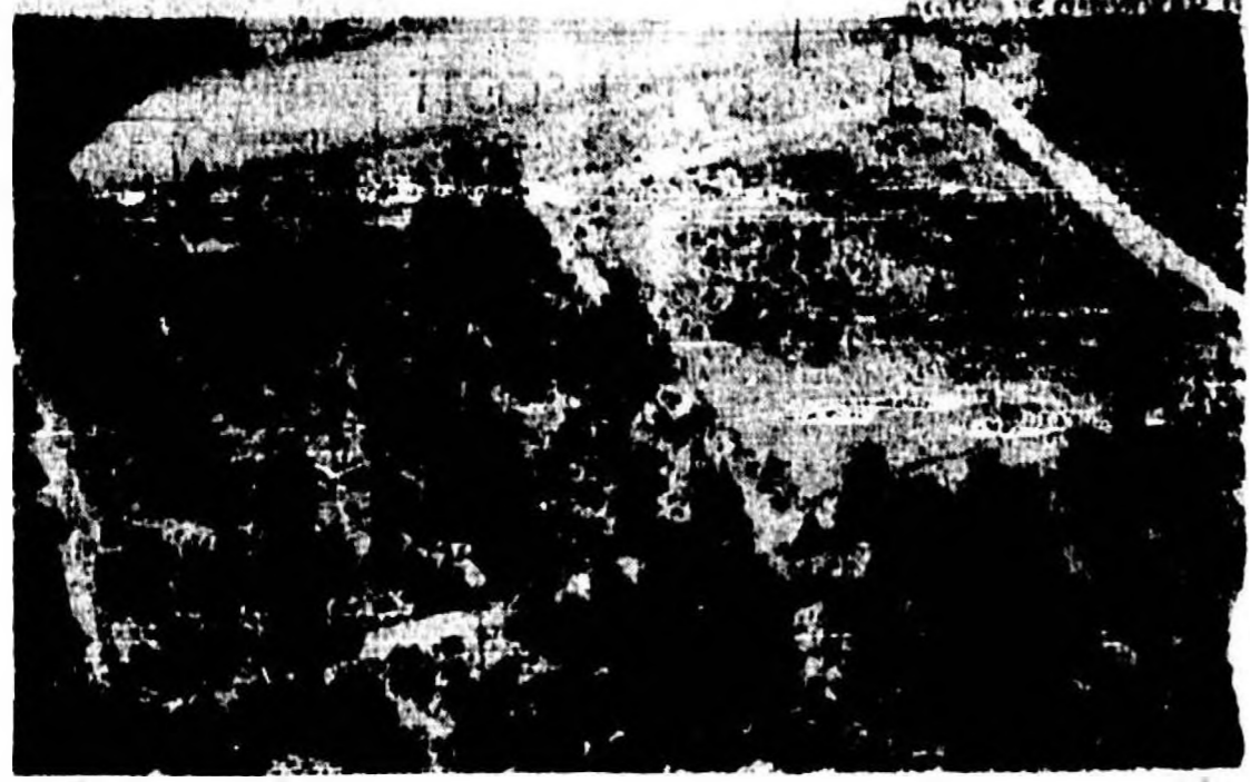
The destructive damage done to Florida's woodland, by their chief enemy, wildfire, is shown in this striking aerial view. The two areas surrounded by plowed firelines are test plots to show the contrast between burned and unburned woodlands. The plot on the left has been unburned since 1941 and has a big stand of pine trees with hundreds of young seedlings, too small for the camera to see, growing among the older trees. Only four pines are left on the plot which has been burned every year. These are stunted and no young seedlings have survived the burnings.

Generally, there is good pasture in the spring and summer and, in some cases, there is more herbage than the stock can eat. This, according to Dr. Glascock, emphasizes the importance of adequate winter feed. Maximum returns from spring and summer pastures can be obtained only when there are enough animals to take advantage of all the grazing available, and the more adequate the winter feed, the more animals there will be to go into the lush grass season. If cows do not get adequate feed in the winter, they cannot produce good spring calves, or they may not calve at all, and summer pastures are reduced. Keeping thus the possibility of raising heavy calves on spring and summer pastures is reduced. Keeping heavy calves is another important factor. Larger acreage of winter pasture, production of more hay, and increased use of citrus and sugar cane by-products and protein concentrates are actively reducing the winter feed problem. The outlook is promising for more progress.