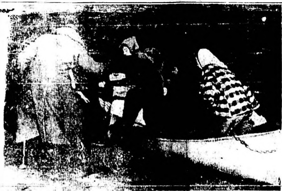
RESCUED FROM A SMALL BOAT which broke away from shore on Lake Winnebago, women and children are safely landed at Fond du Lac. One of the men's small boats which went to their aid. Hundreds of people were on the ice on the 14th, when high winds shifted it away from the shore. More than 250 automobiles were left on the ice and favorable weather conditions would allow them to be removed.