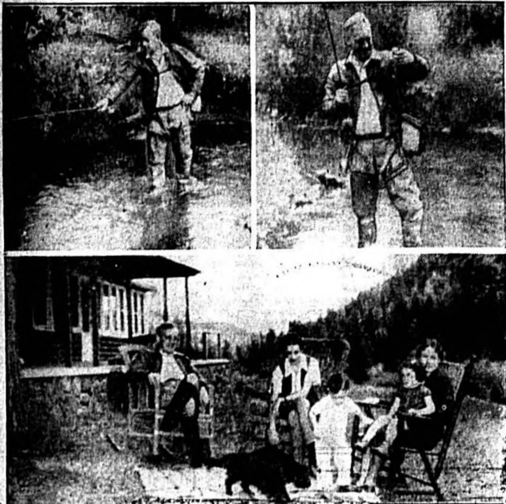
The forthcoming campaign doesn't seem to be worrying Gov. Alf M. Landon, the Republican presidential nominee, at his vacation cottage in Estes Park, Colo. He spends much of his time fishing and the picture at upper right would indicate he's having some degree of luck. Below, is the family group at the cottage. Left to right: Landon, Daughter Peggy Ann, Son John Cobb, Daughter Nancy Jane and Mrs. Landon.