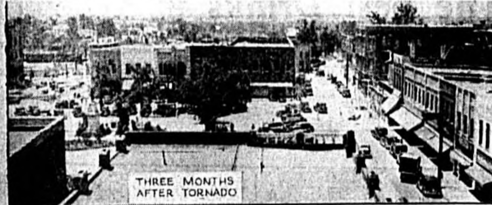
THREE MONTHS AFTER TORNADO