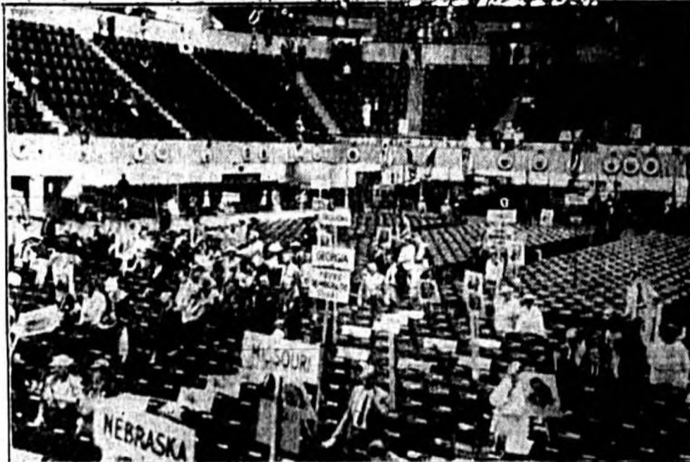
Here is the teeming multitude—of empty seats—at the Democratic national convention when Chairman Robinson rapped for order to nominate Vice President Garner for another term. Delegates demonstrated so long and loudly at the nomination of President Roosevelt the night before that few felt equal to another session of merry-making.