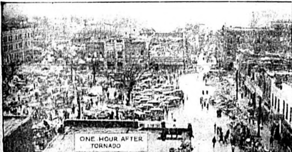
ONE HOUR AFTER TORNADO