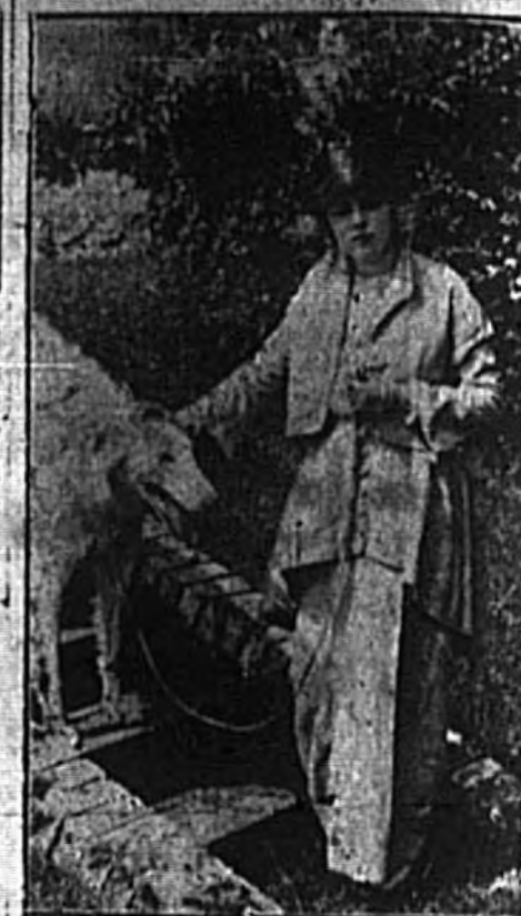
The Fascinating Little Blanche Sweet who will appear in "The Blacklist" at the Star Tonight.

There are scores of big scenes, made in the Adirondacks, where an entire Alaskan town was built for this production. A decidedly novel and interesting scene of a New