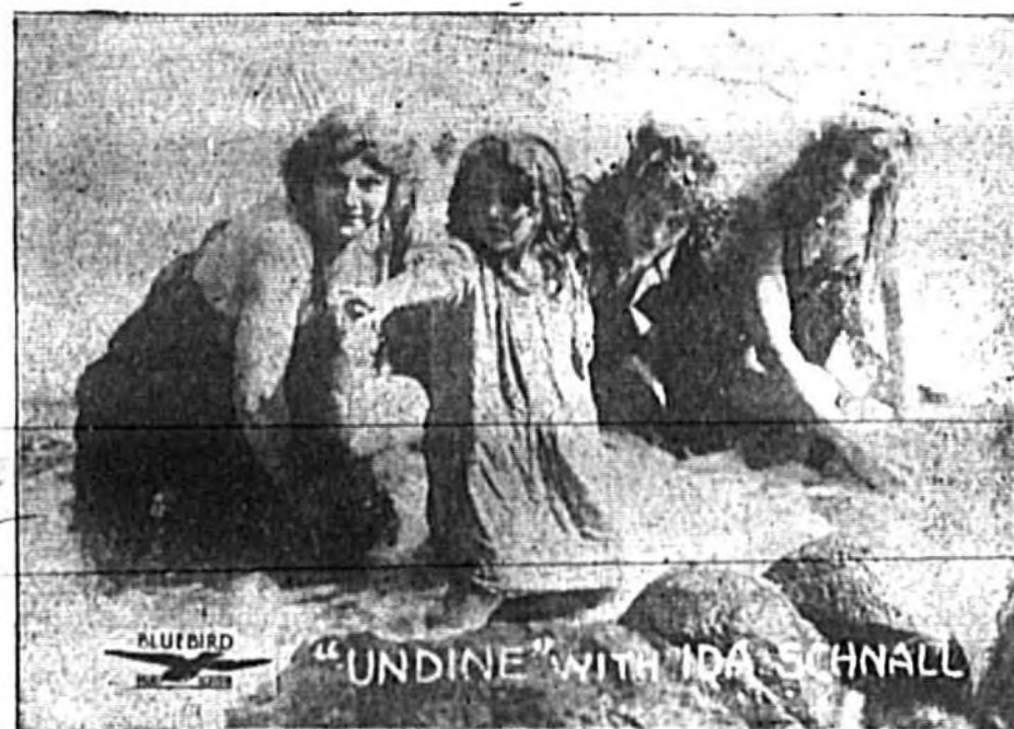
AT THE STAR SATURDAY, MARCH 4th.

Expels scrofulous humors from the blood which cause constipation, malaria, rheumatism, sores, ulcers, pimples, etc. Get it at L. R. Philips on a guarantee to safety.