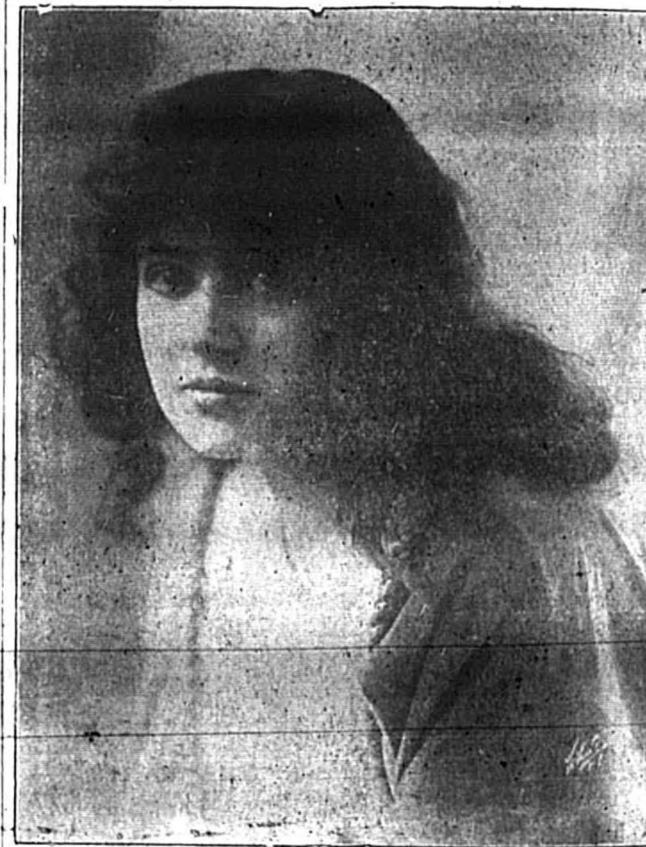
Marguerite Clark who will positively appear Monday at the Star in "OUT OF THE DRIFTS"