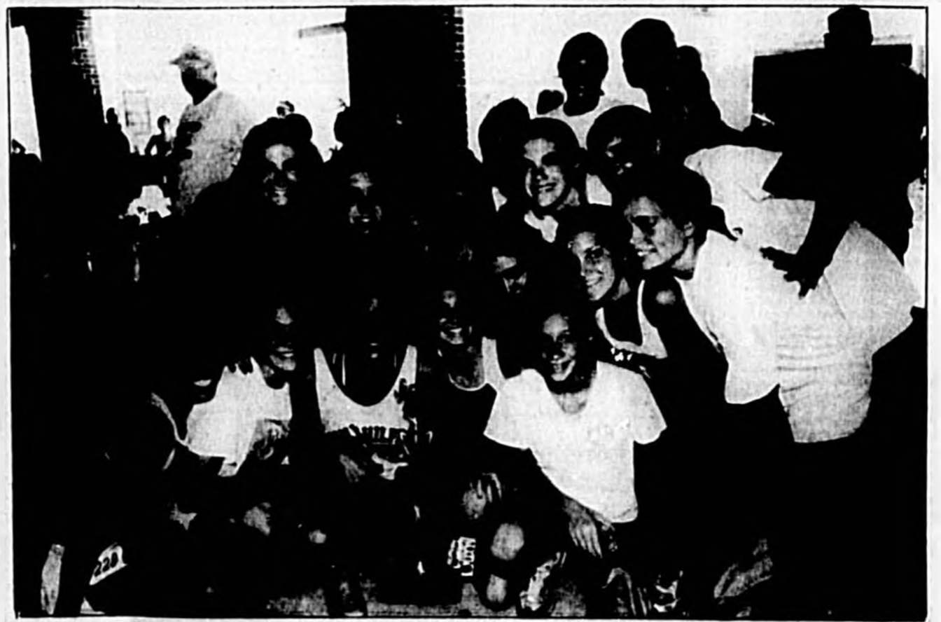
The Flagler Doggs Track Club (top) and Lake Brantley Patriot Track Club (bottom) pose with the team trophies they won in the 16-18 boys and 13-18 girls divisions, respectively, at the 1998 Lake Mary Summertime Cross Country Run on Saturday.