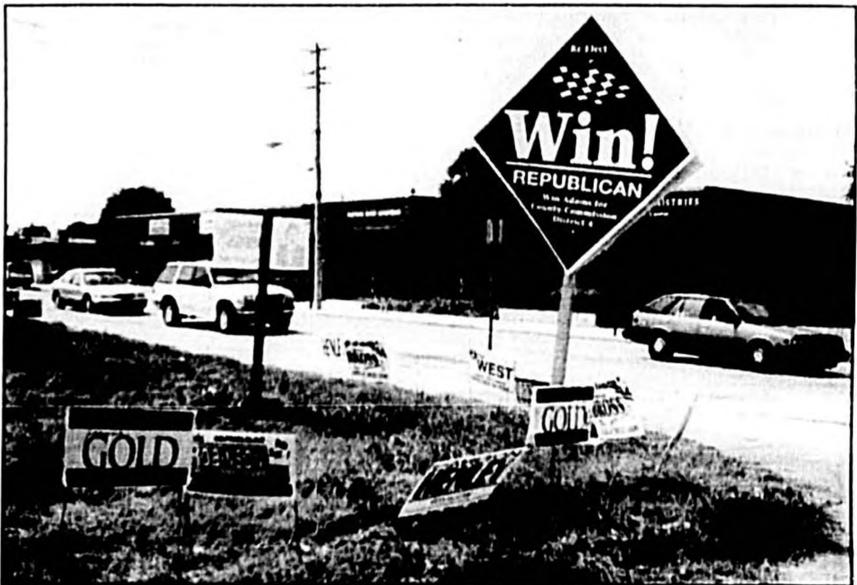
Colorful campaign signs suggest to voters an array of qualified candidates vying for open seats for judge, commission and school board in Seminole County. Most races will be decided today.