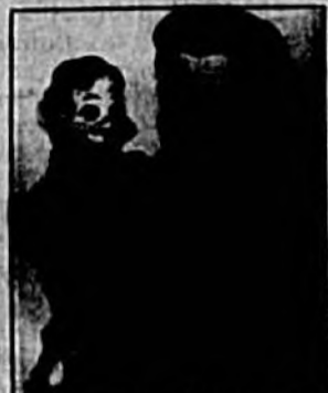
Buffalo Bob Smith

"It's Howdy Doody time, it's Howdy Doody Time...let's give a rousing cheer, 'Cause Howdy Doody's here."