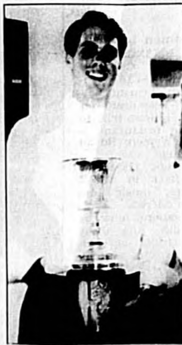
It has been reported that Matt Kuchar will defend his U.S. Amateur title next month and then return to school at Georgia Tech.