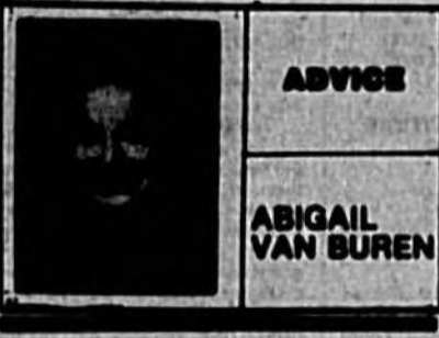
ADVICE ABIGAIL VAN BUREN

DEAR ABBY: I've been dating this girl for a couple of months. When I first saw her, I liked her. When I got to know her, I fell for her. I wanted to spend every minute with her. We have so many things in common - similar backgrounds, a love of books, authors and the theater. I like everything about her. The only concern I have about this relationship is that I can't afford to pay for everything whenever we go out. Even though she only works less than part time and I work full time, I'll be broke soon with the way we're going. I don't want to ruin a potentially terrific relationship over money. What can I do?