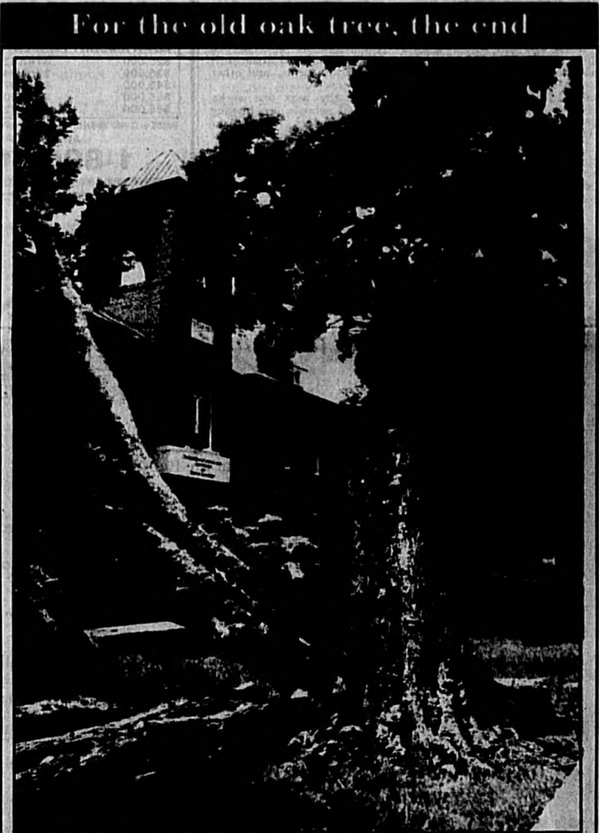
For the old oak tree, the end