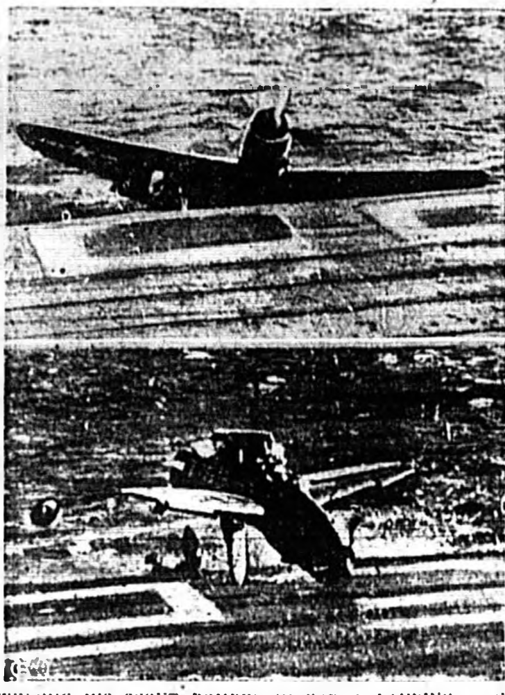
WINGING HIS SCOUT BOMBER IN FOR A LANDING on the carrier Shangri-La, Ensign P. Johnson touches the edge of the flight deck (upper photo) and bounces heavily (lower picture), losing wings and tail and landing wheels, before crashing to a stop. A moment later the lucky ensign stepped from the wreck, unhurt.