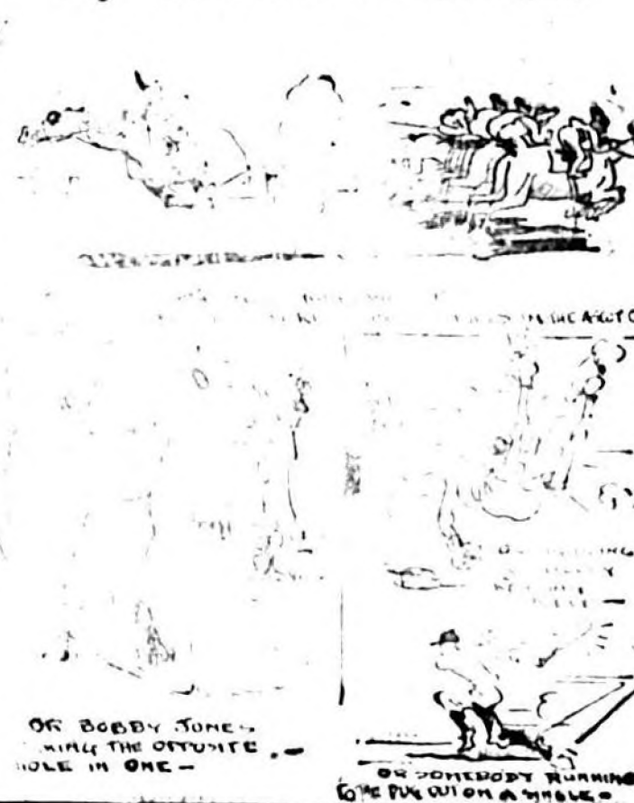
OR BOBBY JONES WITH THE OTTOMAN TOLE IN ONE

IN THE CIRCUIT COURT OF THE TWENTY-THIRD JUDICIAL CIRCUIT OF THE STATE OF FLORIDA, IN AND FOR SEMINOLE COUNTY, FLORIDA. NOTICE OF SPECIAL MASTER'S SALE NOTICE OF SPECIAL MASTER'S SALE