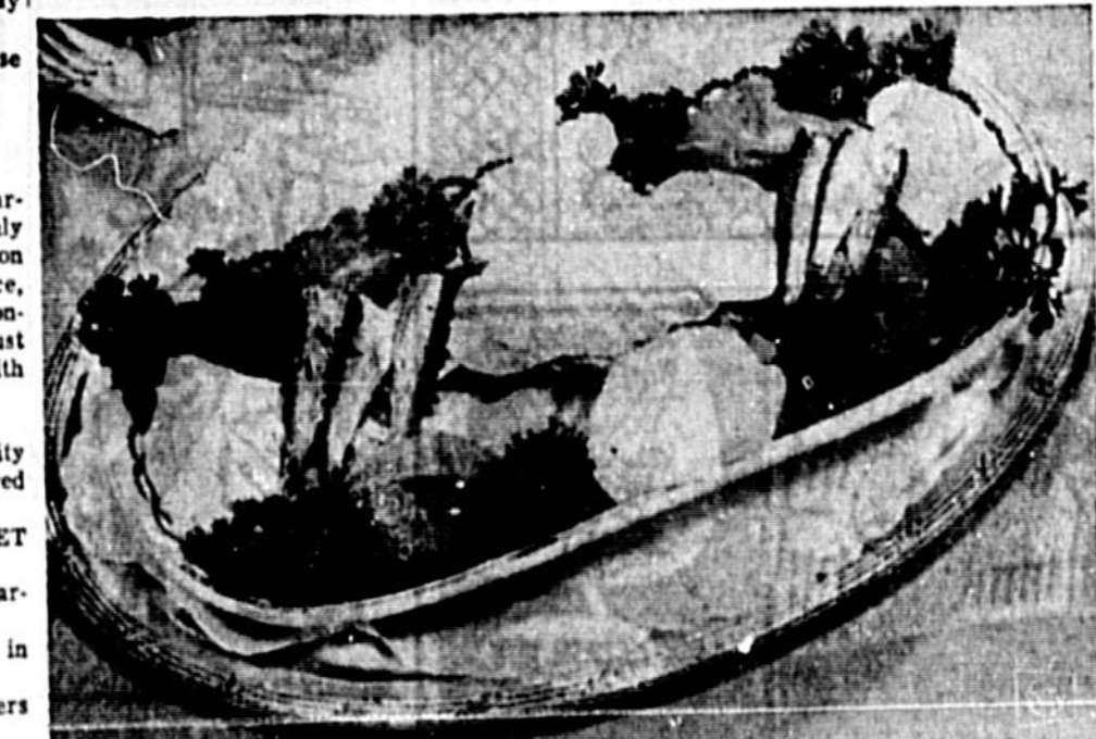
NORWAY SARDINES are geared to entertaining.

Sardines from the icy fjords of Norway adapt themselves happily to warm welcome dishes. NORWAY COCKTAIL DIP 1 can (3 1/2-ounce) Norway sardines 1/4 cup creamy cottage cheese 1/2 cup Worcestershire sauce dash cayenne pepper 2 tps. mayonnaise Drain sardines. Mash sardines with cottage cheese, lemon juice, Worcestershire sauce, cayenne pepper and mayonnaise. Chill thoroughly. Just before serving, sprinkle with paprika. Here's another hospitality dish which can be prepared long in advance. COLD SARDINES GOURMET 2 cups sliced potato (1 1/2 inch dice) 1 can (3 1/2-oz.) Norway sardines 4 hard-cooked eggs, cut in half lengthwise 1 cup chopped parsley 1 lemon, pared and sliced Arrange the potato in a small oval dish. Open and drain the Norway sardines; place half the sardines (about 10) on top in a criss-cross pattern. At each end at both sides of the dish place half a hard-cooked egg. Arrange the whole peppers in four small bouquets between each egg. Place slices of tomato in the center and flank with sardines. Chill and serve. 2 tps. mayonnaise parley bouquets Arrange the potato in a small oval dish. Open and drain the Norway sardines; place half the sardines (about 10) on top in a criss-cross pattern. At each end at both sides of the dish place half a hard-cooked egg. Arrange the whole peppers in four small bouquets between each egg. Place slices of tomato in the center and flank with sardines. Chill and serve.