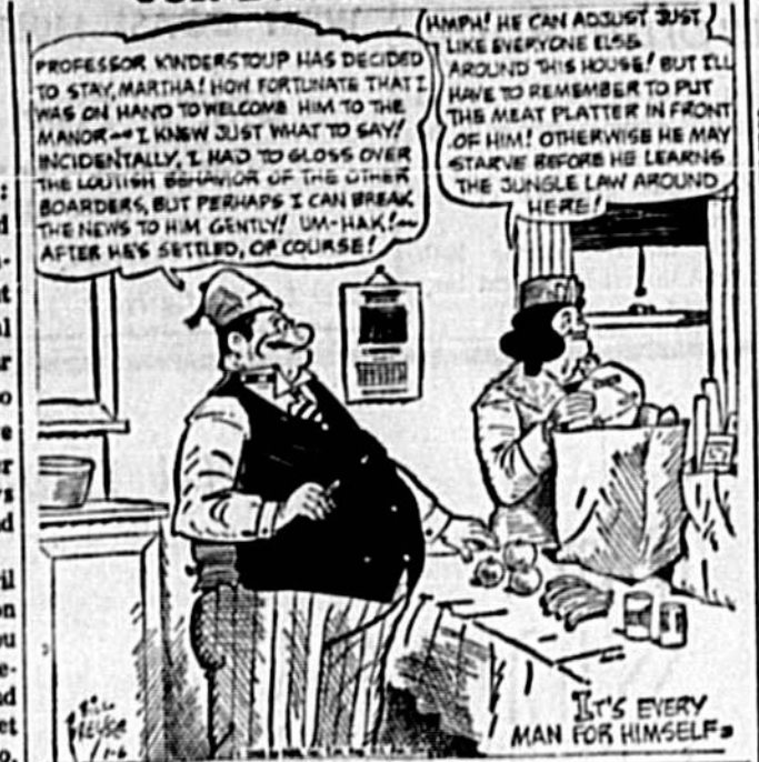
OUR BOARDING HOUSE