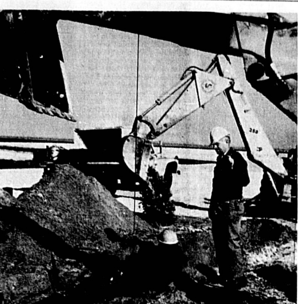
WORK ON LAYING water lines into the massive Marina complex got underway yesterday afternoon...