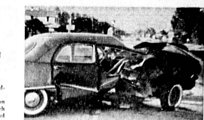
CRASH AFTERMATH (Top Picture - The Walters Car, Bottom picture, the police vehicle)

One person was slightly injured and three automobiles were damaged in a collision at 5:30 p.m. Thursday at Sanford Avenue and 27th Street.