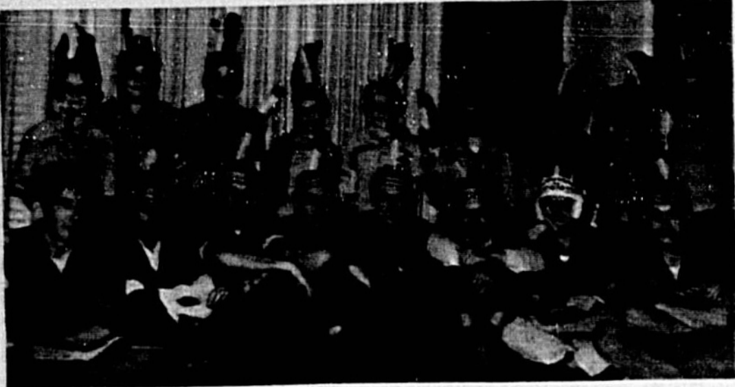
"LITTLE BRAVES" boys too young for cub scouting, must be accompanied by parents...