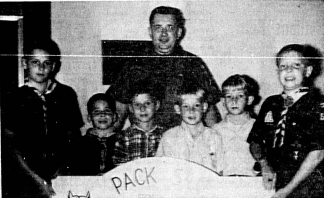
CUB SCOUTS receiving advancement awards at Pack 540's Blue and Gold Banquet...