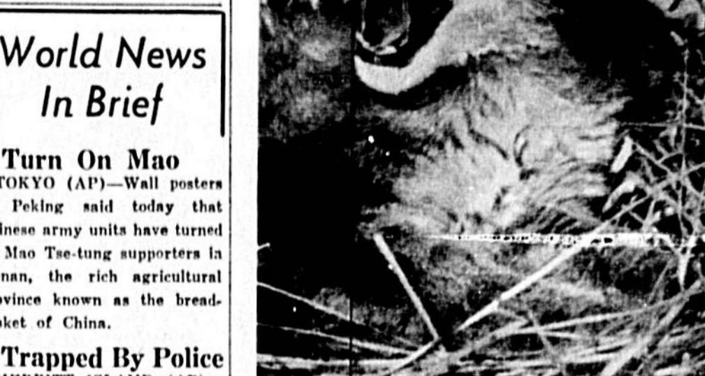
SANFORD ZOO population was increased with one female, six-month-old cougar this morning. Largest of the North American cat family, the animal also called a mountain lion, puma and catamount...