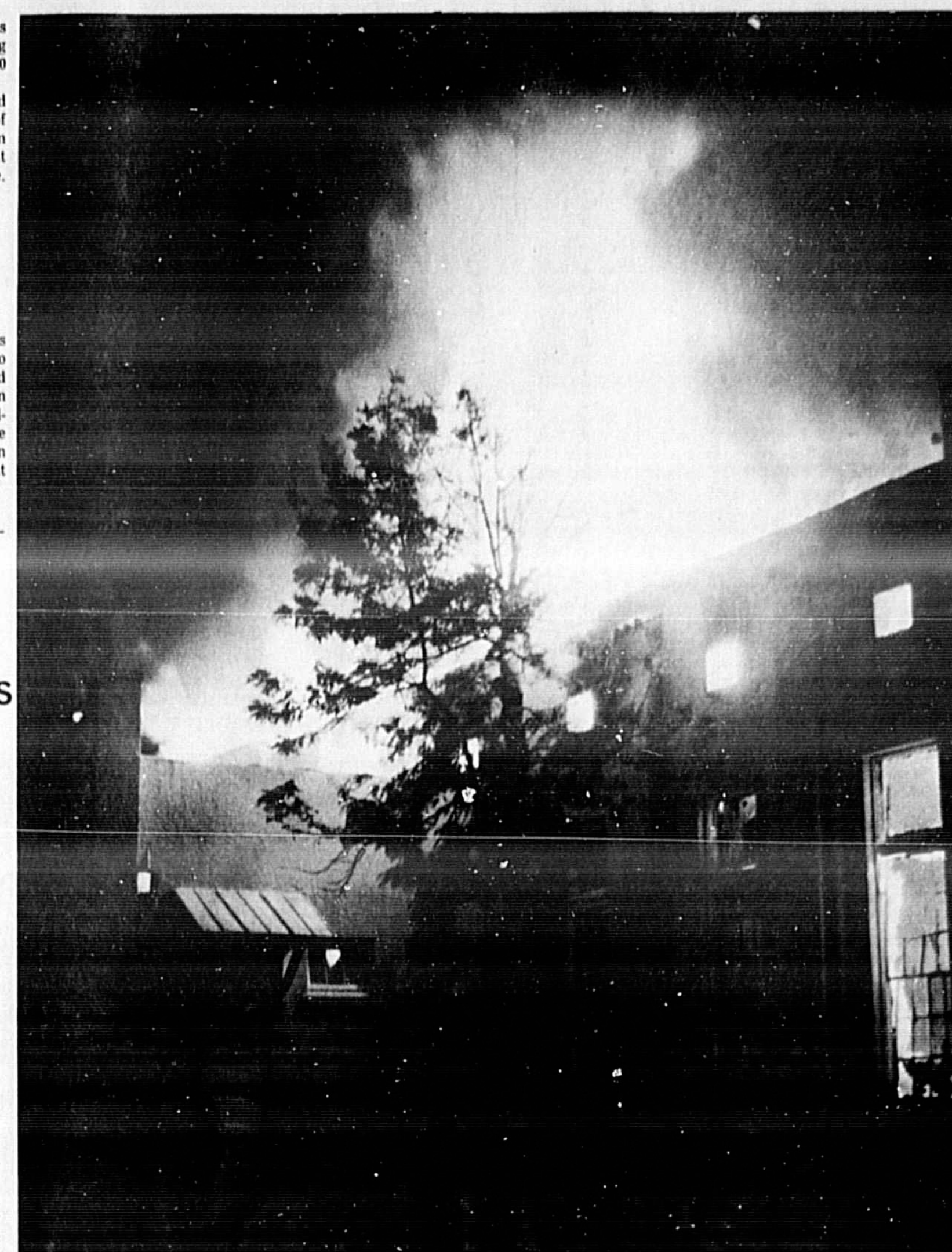
46 YEAR OLD SCHOOL IN FLAMES