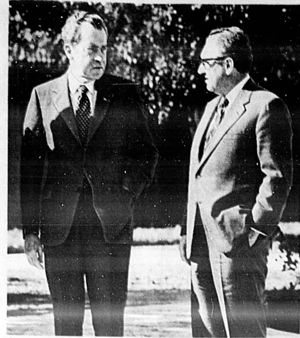
SOMETHING IN COMMON besides peace can be seen between President Nixon and national security adviser Henry Kissinger in this Key Biscayne, Fla., scene. They both hold their left hands in their pockets.