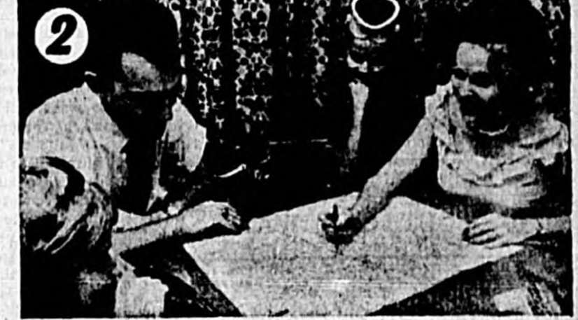
2 YOU'LL RECEIVE without delay a personalized routing of your vacation trip on well-marked, easy-to-follow road maps... showing the shortest and best route or the most scenic one. Also, it will show points of interest you won't want to miss!