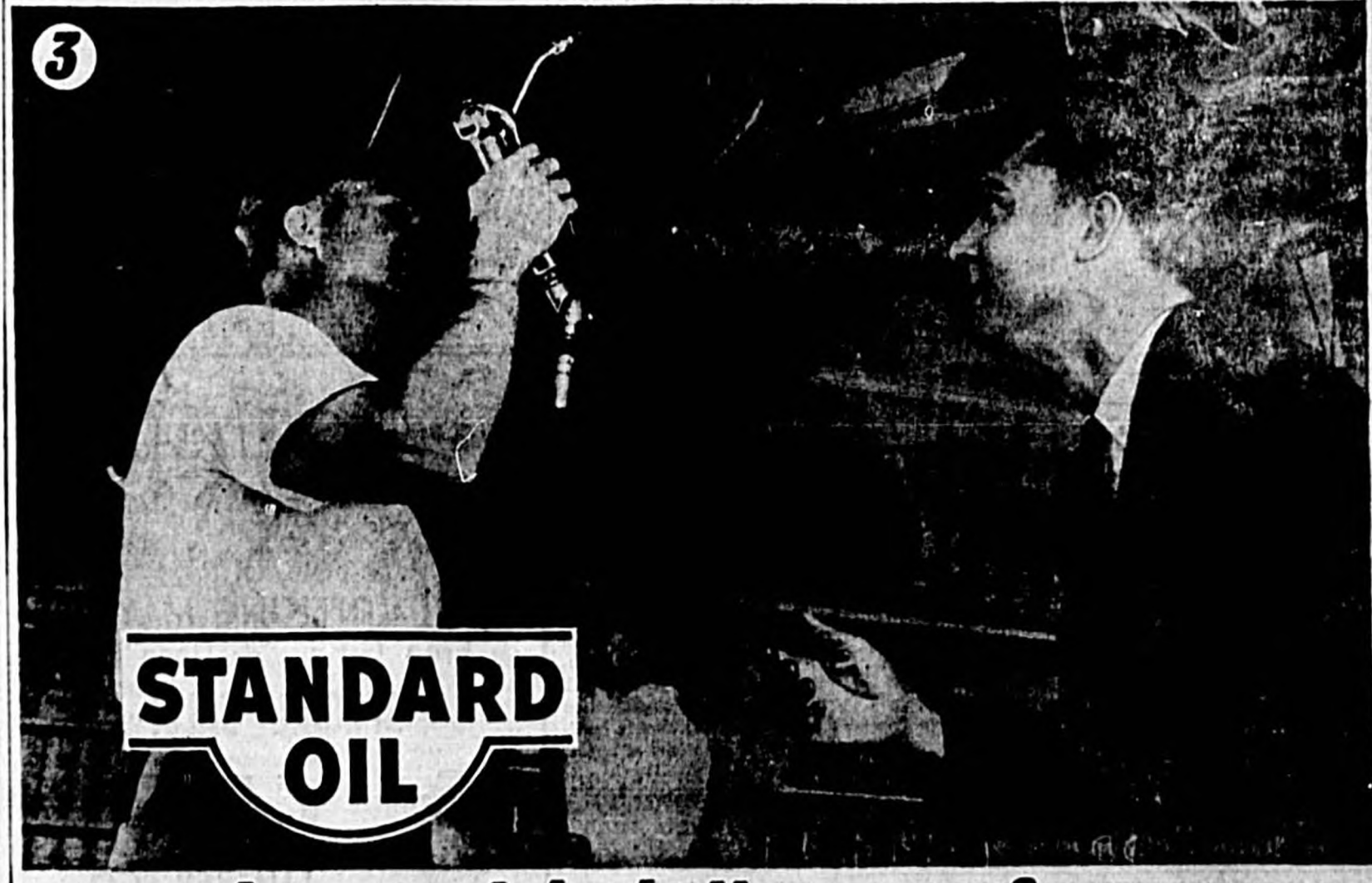
3 BEFORE YOU GO ask your Standard Oil Dealer to service your car, to be sure it's ready for a carefree vacation trip!