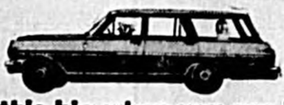
and this big when you gas it up

That, in the eyes of most Chevy II wagon owners, is just about the size of it. A king-size appetite for cargo. But a dainty one for gas. And this, we hardly need add, is just the kind of wagon we planned it to be. Taut and trim as it is on the outside, we went to great lengths to keep it BIG where a wagon should be BIG. The load platform extends a full nine feet from the back of the front seat to the tip of the lowered tailgate.