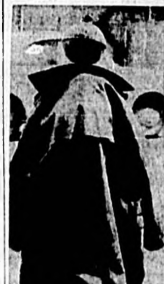
"TAKE ME TO..." — Out-of-this-world "visitor" in Toledo, Ohio, is a pretty down-to-earth fellow. His head is a highway construction flare, the "body" is a workman's raincoat, and his spine a parking meter stand.

Bridge — Page 6 Classified — Page 3-A Comics — Page 2-A Dear Abby — Page 6 Editorial — Page 1-A Entertainment — Page 7 Legals — Page 2-A & 3-A Puzzle — Page 2-A Society — Page 6 Sports — Page 9