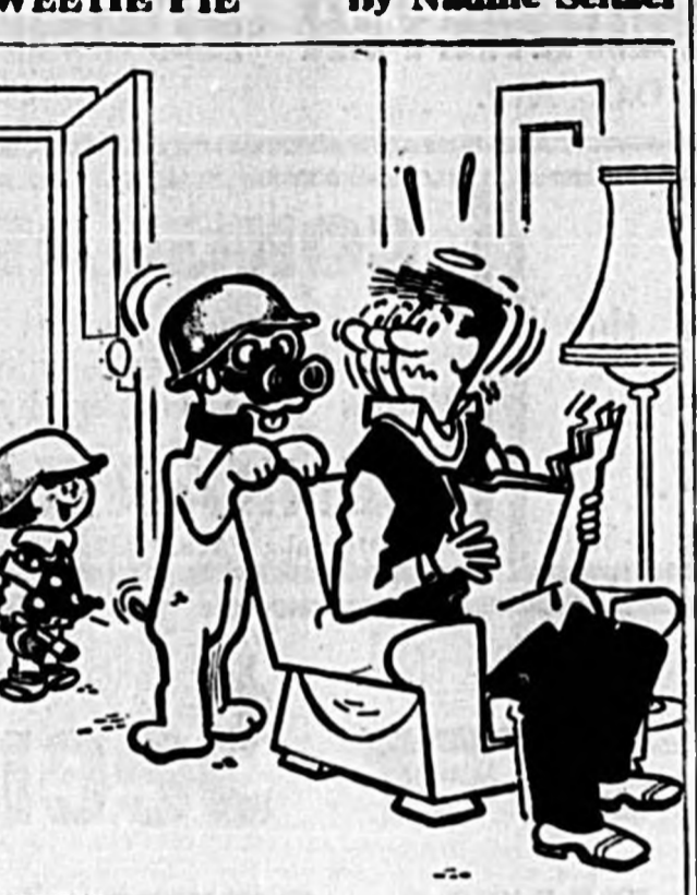
"Shultz wants to say goodbye before he goes off to war!"

6. For Rent Eff. Furn. Apt. 611 Park. 3 BEDROOM house. Kitchen equipped. Call after 5. FA 2-3138.