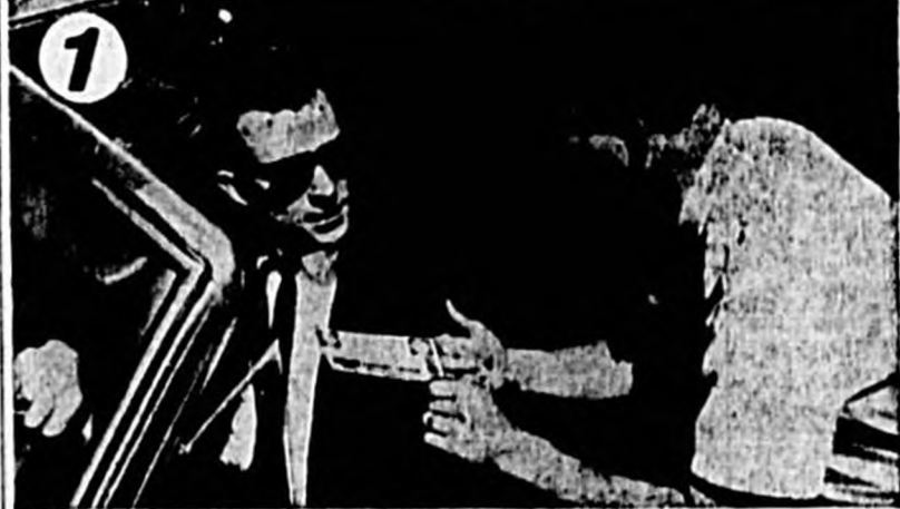
1 DRIVE IN soon and get a handy postage-paid request card from your nearest Standard Oil Dealer. For a free routing of your vacation trip, fill out the card... telling us when and where you plan to go... and mail it in to Standard Touring Service.