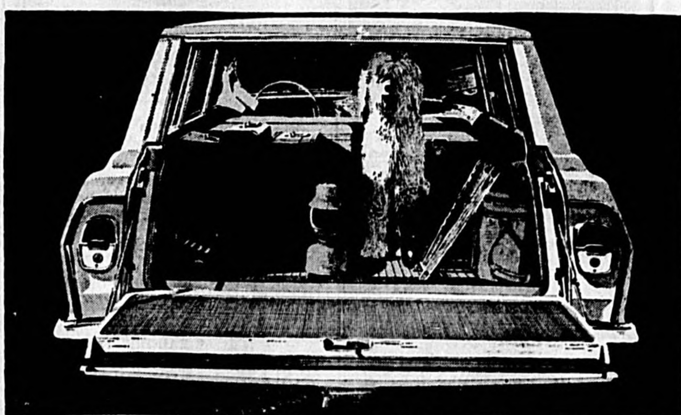
A Chevy II wagon looks this big when you load it up

...where we take better care of your car