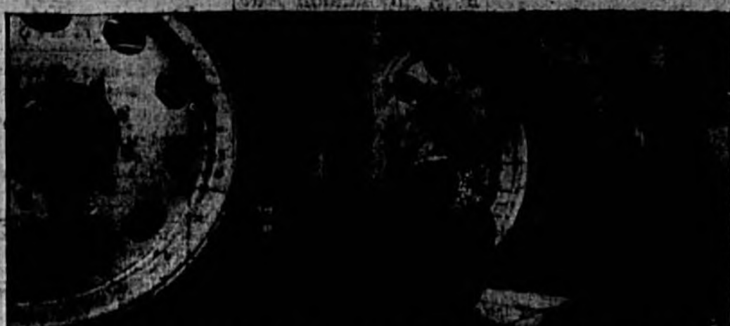
DESIGNED FOR HASTE ON BARRER WASTE , this 3,350 horsepower, 50 foot monster of speed will be driven across Utah's salt flats by Capt. G. T. Kyles in an attempt to beat the world's auto record from 260 miles-an-hour to approximately 400. Engineered in design, it is equipped with eight wheels and six fans in addition to a conventional banking system. The streamlined creation weighs seven tons.