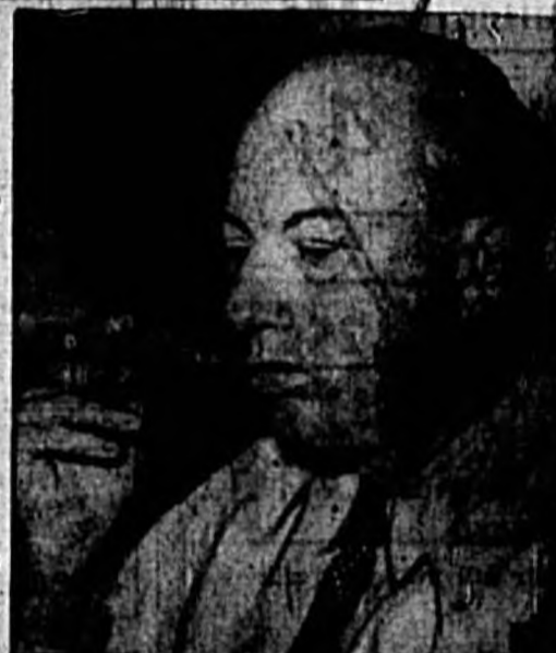
While most of his senate colleagues were vacationing, Pat Harrison of Mississippi puffed his cigar, worked on in Washington, seeking aid for cotton growers. He it was who lost senate leadership by one vote.