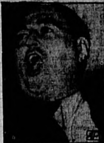
ROAD CLOSED was the figurative sign posted by Massachusetts Governor Hurley when Georgia officials sought return of a chargin' fugitive.