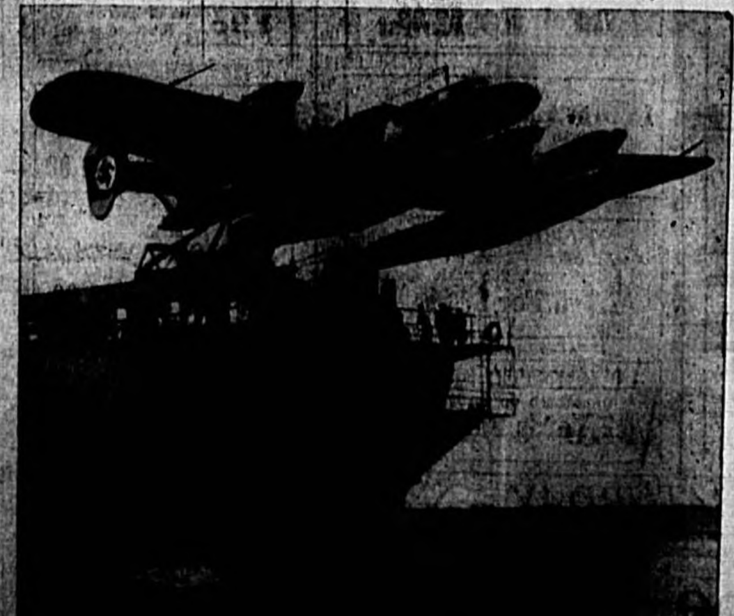
A TRANSATLANTIC HERRY-60-ROUND of shipping sky ships across the sea has been joined by Germany in addition to the United States and Great Britain. All shipping preparations for next summer's destination of Europe by service between Europe and America. Here is the information concerning the HERRY-60-ROUND of the Atlantic Ocean. It is a new ship built after the latest design and equipped with the most modern machinery. It is built for speed and is expected to be the fastest ship in the world. It will be built in Germany and will be owned by the German Government. It will be built in Germany and will be owned by the German Government.