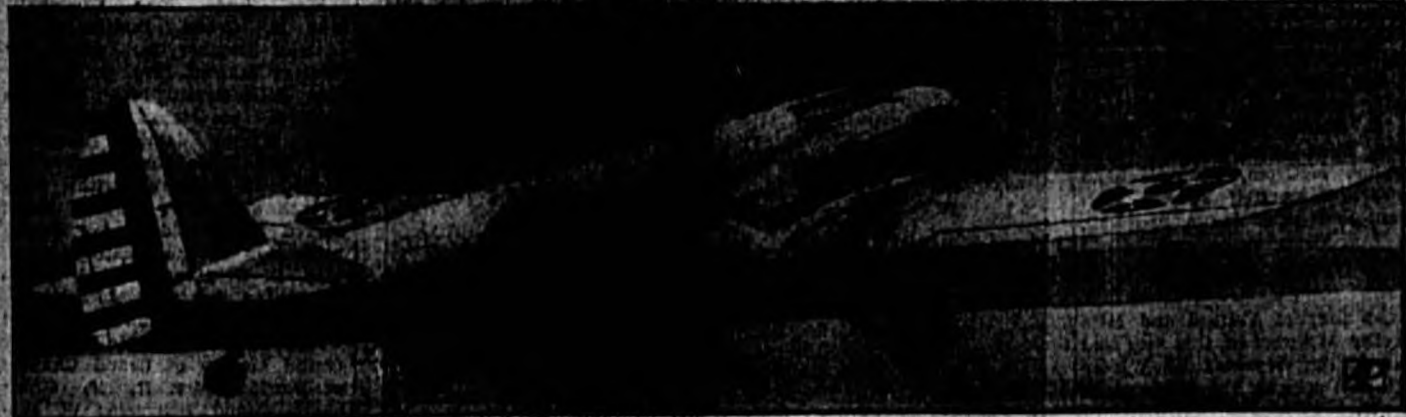
Army's antidote for flying fortresses is this twin-motored multi-seater fighting plane which passes its initial test flight with flying colors. A pusher plane with propellers behind the wings to leave the frontal area clear for machine-gun fire, this sky raider carries more powerful armament than any fighter ever built. A crew of five has six guns at its disposal and a supply of light bombs. With the tremendous speed of a racing ship, the craft is believed easily capable of overhauling the "Flying Fortresses" which themselves fly more than 250 miles an hour.