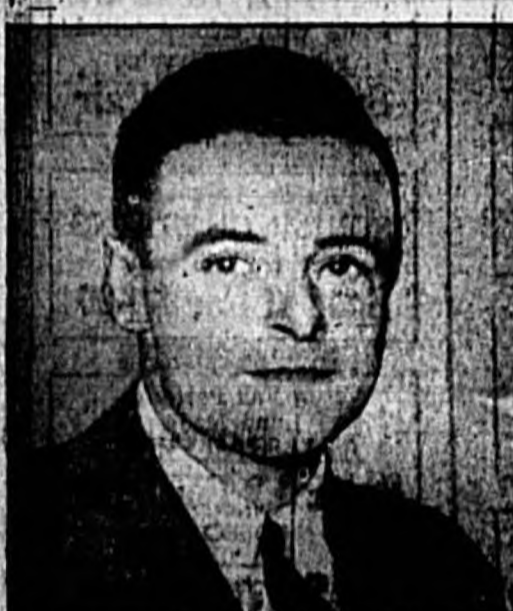
Opportunity to become the youngest President the U. S. has ever had is knocking at the door of Massachusetts' 35-year-old senator, Henry Cabot Lodge, Jr. (left), according to Patrick Hurley, ex-secretary of war.