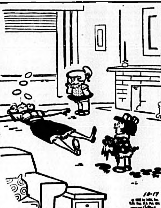
'You'd think she'd never seen split ketchup before!'