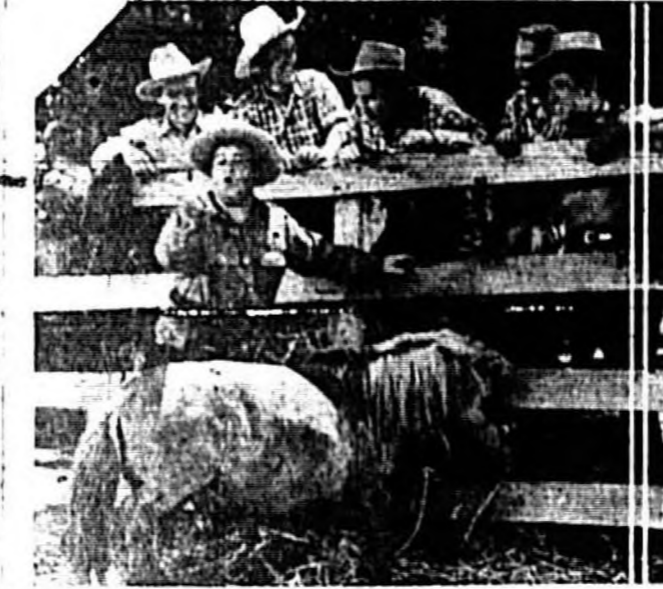
"Kingston For a Horse" quotes Lou Castello to the Merry...