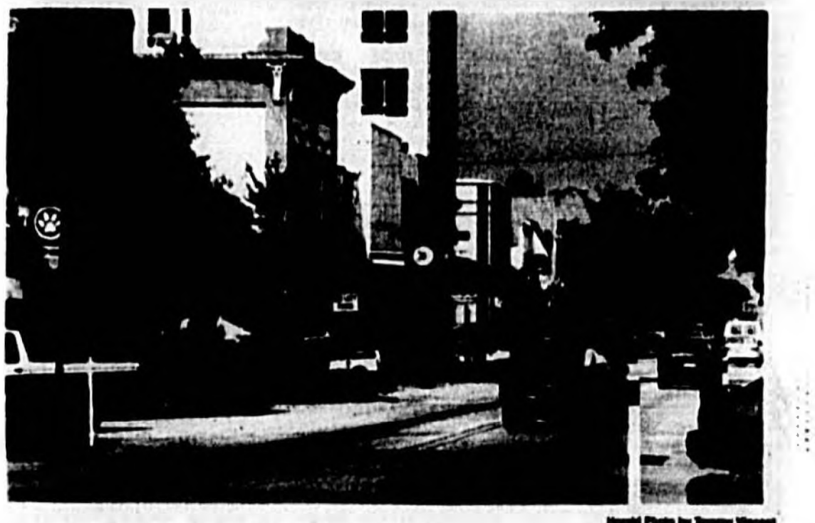
Historic Sanford will be featured in a documentary on Central Florida.