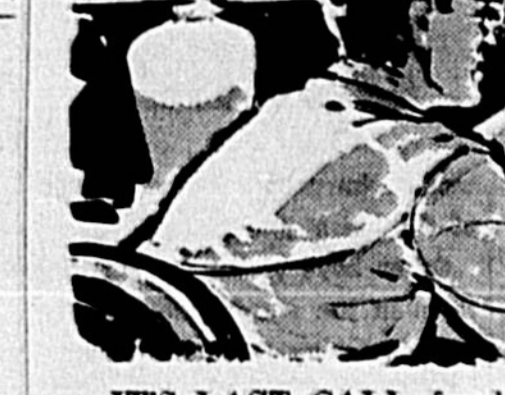
IT'S LAST CALL for '66 stock transactions.