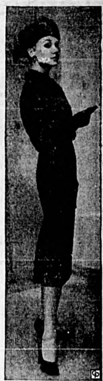
FROM THE COLLECTION OF ADELE SIMPSON comes an imported wool tweed three-piece suit in Durma Ruby. The wing-back bolero jacket tops a real barathra blouse and slim swallow-tail skirt. A good travel suit, good winter fare under a coat and smart for spring.

er, stir in the green pepper. Add water if the mixture is becoming dry. Cover and simmer 20 to 25 minutes or until the green pepper is tender. Add more water if more gravy is desired. Stir and cook several minutes to mix this water with the gravy. Place the hot cooked rice on a platter. Top with the beef and gravy. Serve extra gravy in a separate dish. This recipe makes 4 to 5 servings.