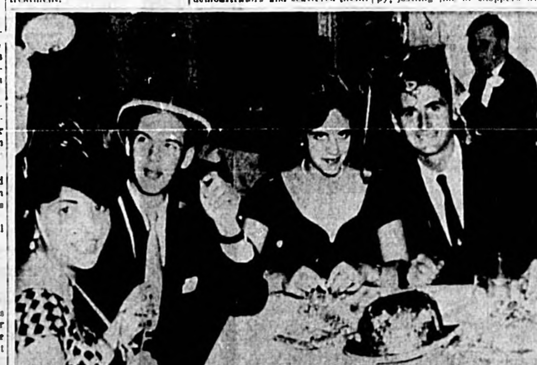
ONE OF THE GAY parties at the Mayfair Inn du in the New Year's Eve celebration. The gala event which started at 10 o'clock with dancing, was interrupted briefly at midnight for the meretricious and noisy in welcome New Year, and concluded with a buffet in the Mayfair Inn's dining room.