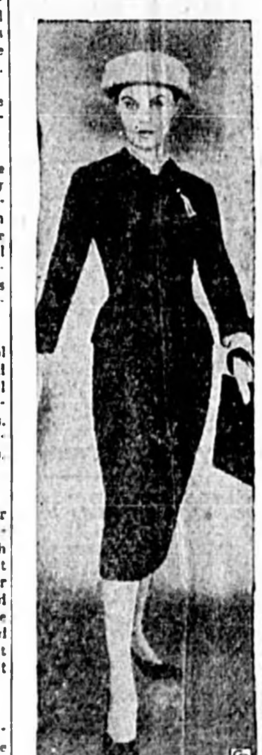
SATIN TOUCHES FOIT A SLIM, FITTED SUIT of black ribbed worsted—from the collection designed by Beni Claire. Black silk satin is used for the turned-back cuffs, piping for the collar and jacket closing. A jeweled "watch" decorates one breast pocket. Smart for winter under a warm coat and later for spring.

AT THAT TIME, they predict, your bedroom will feature radiant panels suspended above the bed to keep you comfortable without blankets. The bed will push into the wall when you aren't sleeping in it. There will be a TV screen in the bedroom so that Mom can check on Junior in the nursery while she reclines. There'll be a television telephone in the kitchen so Mom can keep tabs on Dad all day, if she likes. An electronic device will enter her to plan menus, specify the number of servings for each meal and select the time when it will be automatically prepared and served. Bed sheets, table linens, dishes and cooking utensils will all be the disposable kind, so there'll be no storage problems. (That's the way they thought that one.) OH, YES, if Junior gets out of hand, all you do is push a button. Out comes an electronic retract-