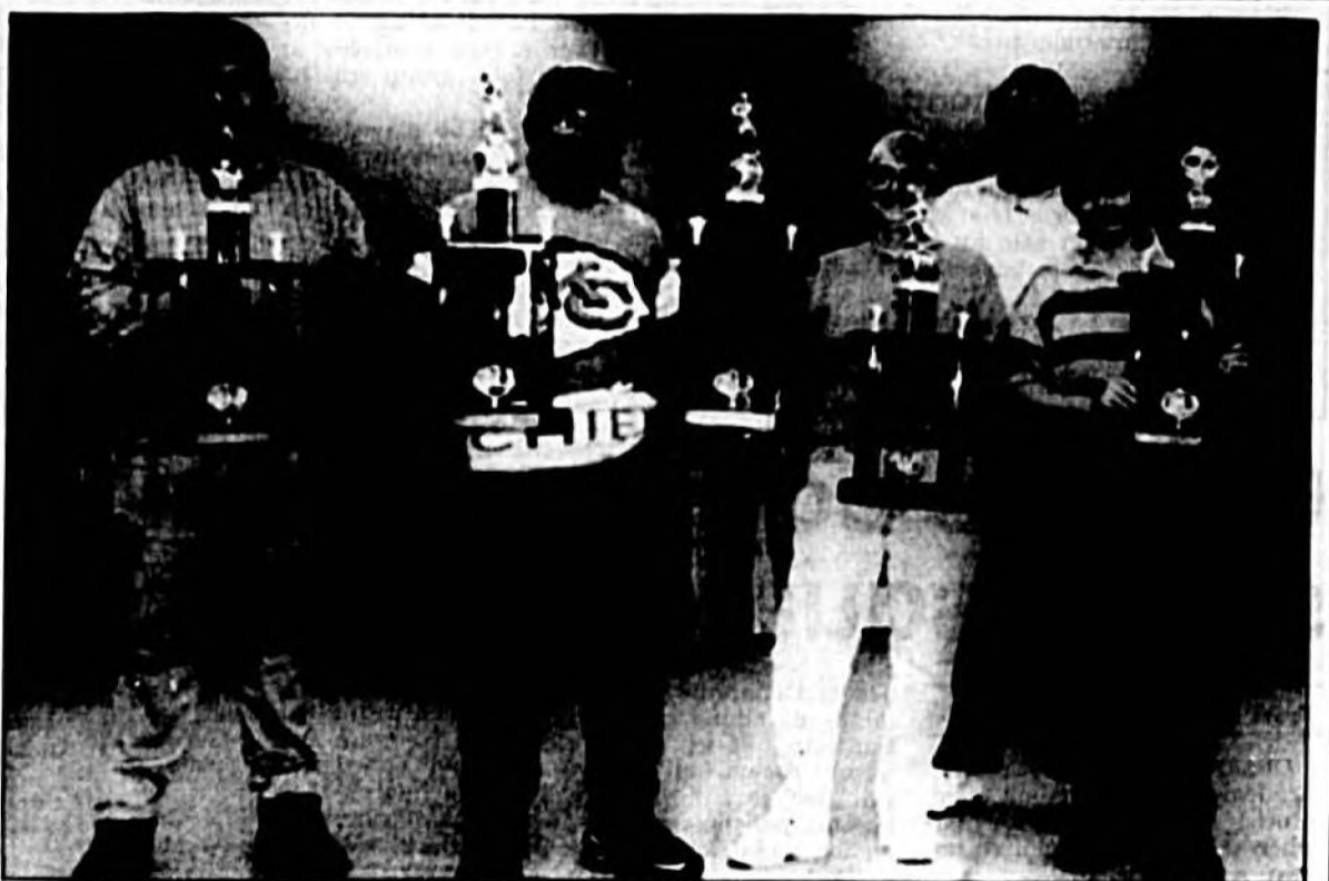
SANFORD - Coaches of the winning teams from the Sanford Recreation Department Fall Slowpitch Softball Leagues pose proudly with the trophies they received during an awards ceremony Tuesday night. The SRD is currently registering teams for the Polar Bear Leagues that will begin play in January.