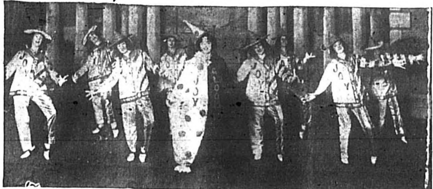
Geo. M. Cohan's Big Musical Farce, The Little Millionaire, Imperial Theatre, Thursday, Nov. 20th

Oyster Supper and Social at Duckworth's Store next Saturday night at 6 o'clock for the benefit of the Woman's Club. 24-2tp