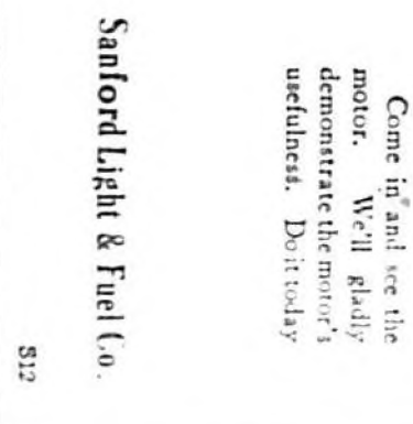
Your Wife's Comfort

MISCELLANEOUS - The Watson Thresher... The Watson Thresher is the best