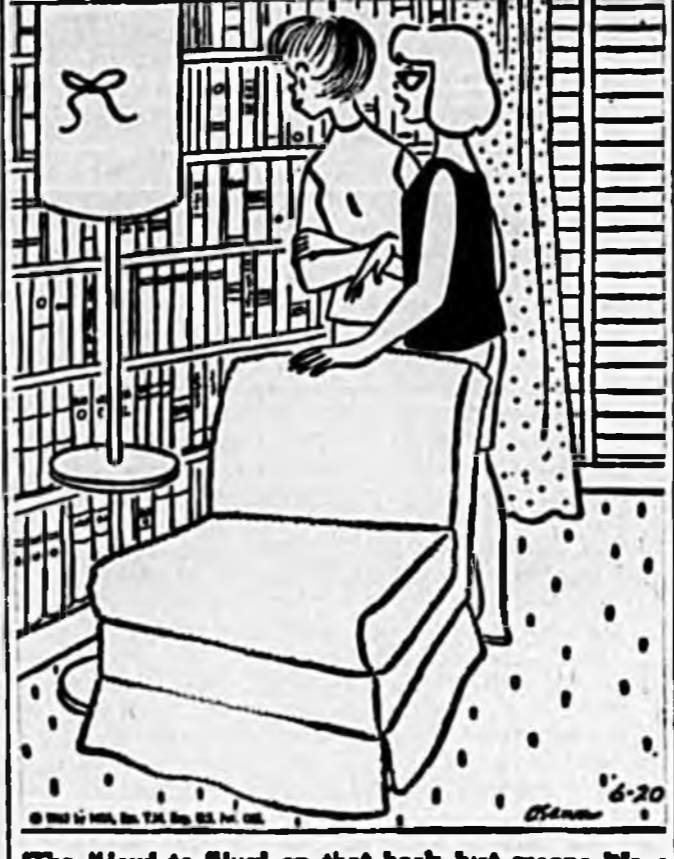
The 'How' to 'Hug' on that book just means it's a volume of the encyclopedia!