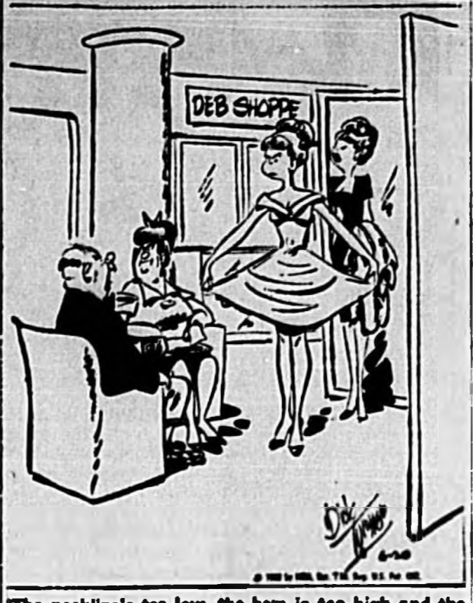
The neckline's too low, the hem is too high and the payments too long!