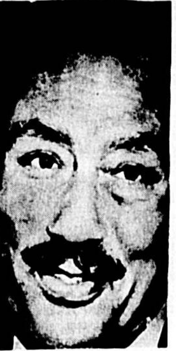
Anwar Sadat (above) president of Egypt, is a moderate who draws a line between temporal and spiritual matters, saying religion has no place in politics.