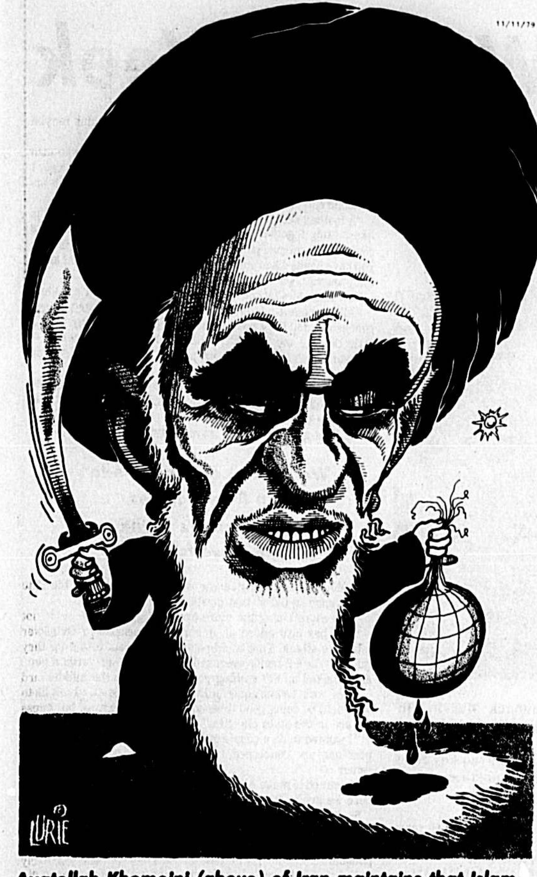
Ayatollah Khomeini (above) of Iran maintains that Islam — as laid down in its holy book, the Koran, and the words and deeds of its Prophet Mohammed — should govern the political, economic and social conduct of state affairs, not merely individual spiritual life.

CAIRO, Egypt (UPI) — Islam is religion and the world. More than 700 million adherents in 70 countries — and most Moslem scholars — describe the youngest of the world's three great monotheistic faiths.