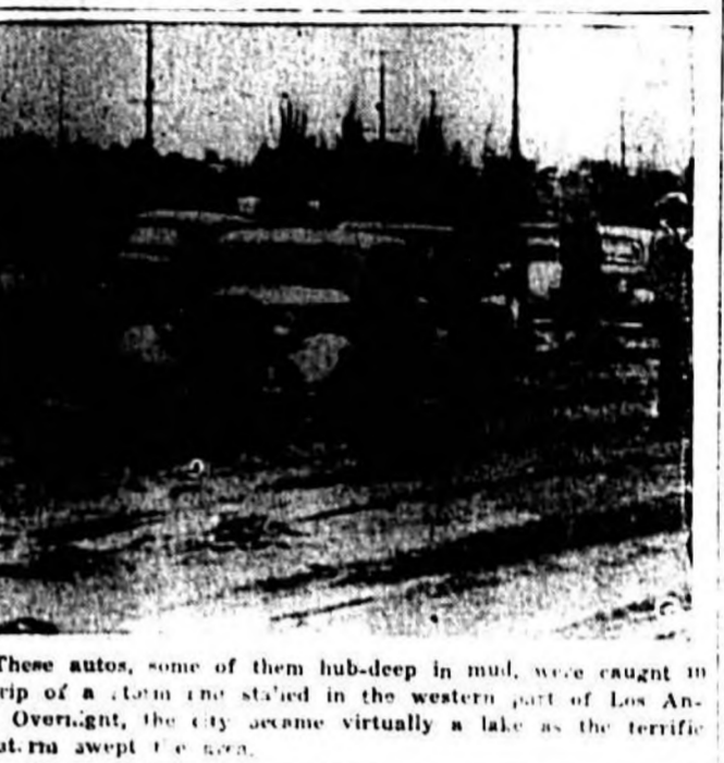
These autos, some of them hub-deep in mud, were caught in the grip of a storm stalled in the western part of Los Angeles. Overnight, the city became virtually a lake as the terrific rain at first swept the area.