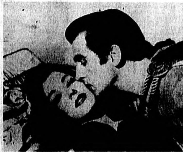
Stewart Granger and Eleanor Parker play the lead roles in M-G-M's swashbuckling technicolor feature, "Scaramouche." A tale of passion, adventure, and gallantry in a nation in revolution, this film is an admirable vehicle for their distinguished talents.