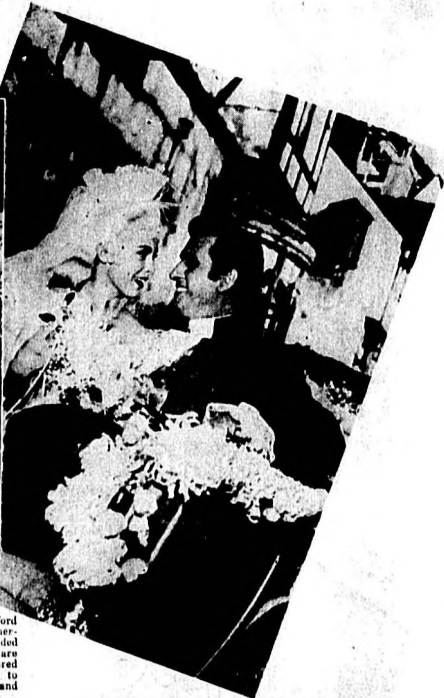
An exciting and stimulating fare of motion picture entertainment is to be laid before the people of Sanford and Seminole County in the coming months. In an all-out effort to bring the best in pictures to people of America M-G-M, of Hollywood is turning out an astonishing number of real movie greats. Leading the star-studded parade of smash hit entertainment is "Scaramouche" destined to be one of the year's biggest. At top right are Janet Leigh and Stewart Granger who will share starring honors with lovely Eleanor Parker; at left is pictured Robert Taylor and Joan Fontaine in the Technicolor marvel, "Ivanhoe," a Sir Walter Scott classic; "Lovely to Look At", center, is one of those star-studded, gorgeously spectacular Technicolor musicals replete with fun and frolic based on the stage hit "Roberta" with Jerome Kern's music.