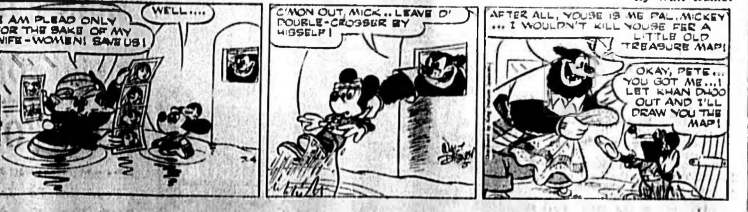
MICKY MOUSE By Walt Disney