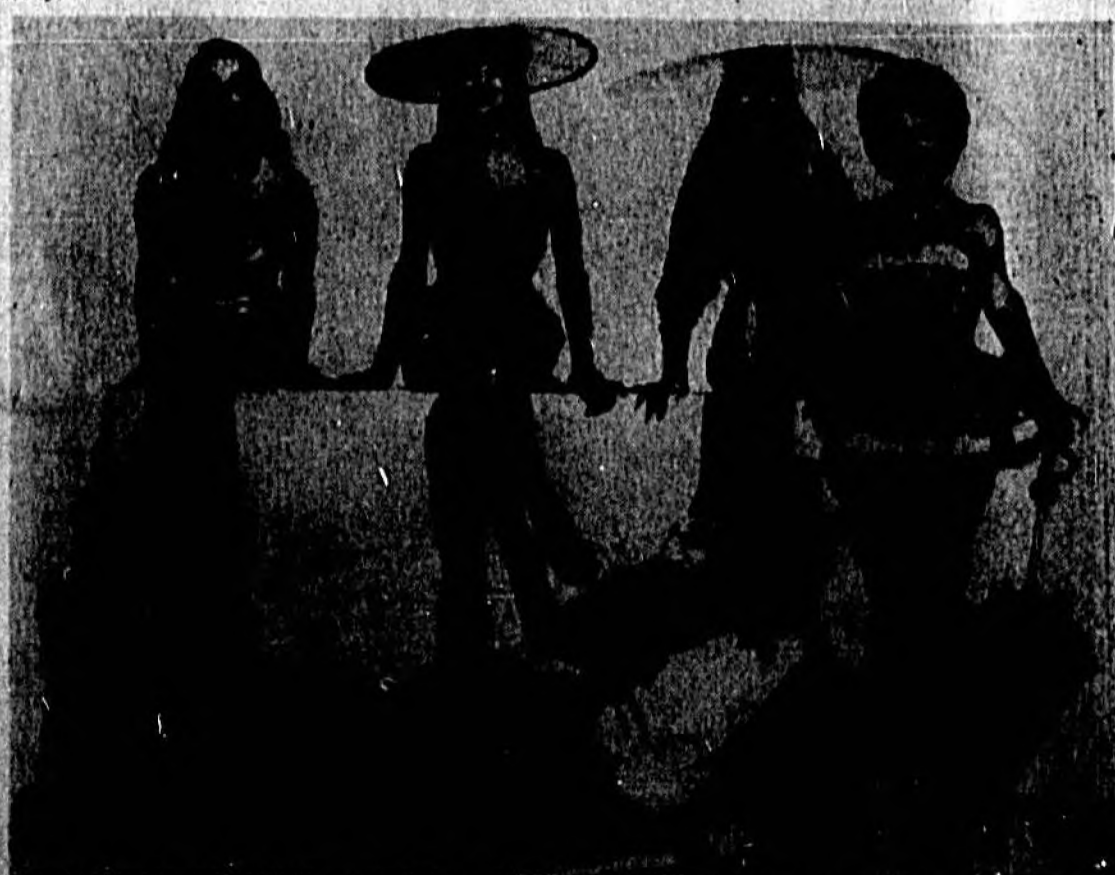
The American humor comedian Red Skelton has a great time in M-G-M's "Lovely to Look At" and he will put it on the theatre when this picture comes to Sanford. A show of comedy will delight your troubles, foreign and domestic, in a gale of laughter and a show of comedy is at his earliest best and the picture will provide a great night's seeing for the town.