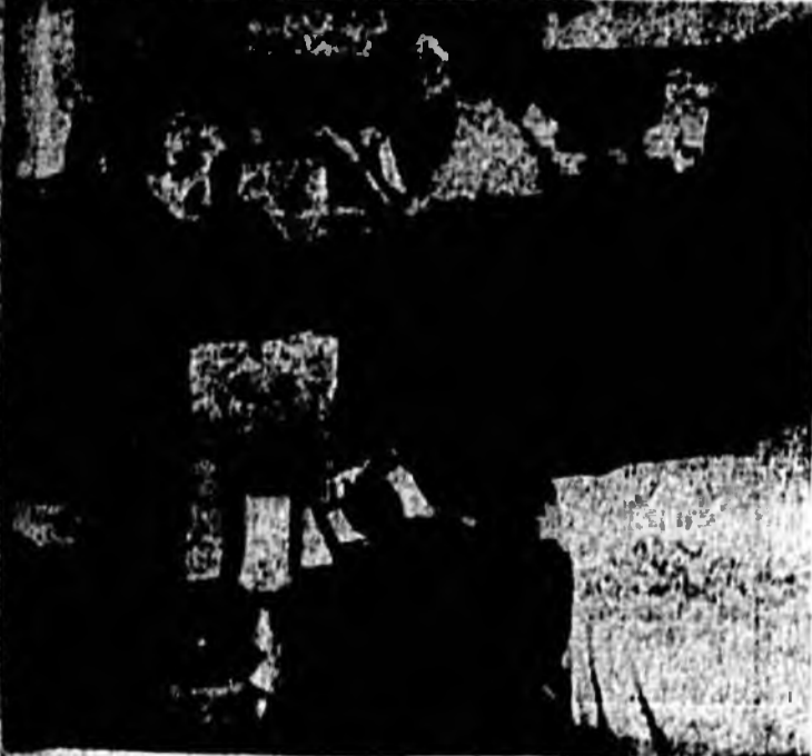
NEGROES WAIT IN VAIN FOR SERVICE —Negro teenagers seeking to break the color barrier at an Oklahoma City, Okla., department store lunch counter wait in vain for service as white customers watch. More than 100 Negro youths doggedly began a third day of passive demonstration at the luncheonette.