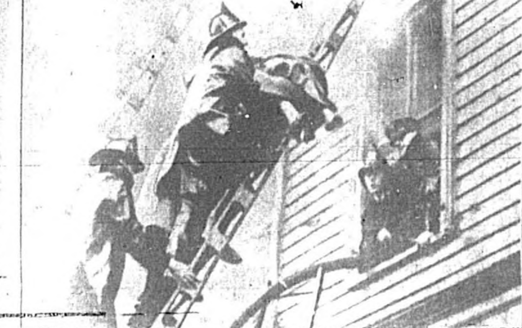
Five children were killed and five others injured in a fire that broke out at a school playground in Lawrence, Mo. ...