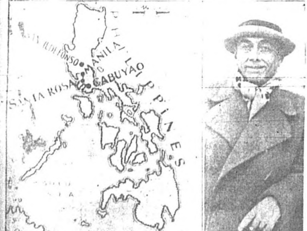
Bloody outbreaks in an uprising against the present government have brought death to more than 10 persons. Forty-seven were killed and five others were reported dead at Santa Rosa. The map shows the locations of the fighting. The uprising was started by extremists known as Sakdalistas who want immediate freedom for the islands and are opposing the leadership of Manuel Quezon (right), president of the Philippines senate, now in New York, address to the independence of the United States Congress, which specifies the islands must pass a 10-year transitional period before obtaining freedom.