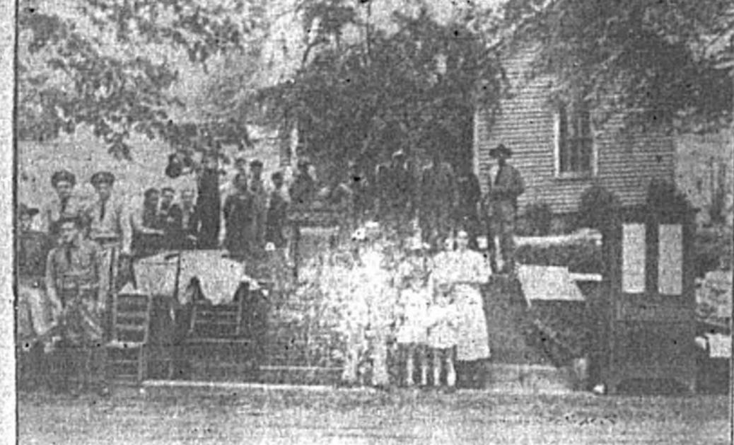
Textile strikers facing eviction from mill were clashed with National Guardsmen in a rough and tumble fight at Lawrence, Mo. ...