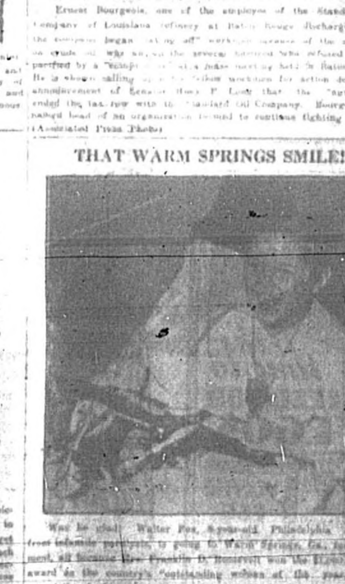
SAW BRUNO TRAIL 'JANSIE' THE EVIDENCE IS IRRESISTIBLE, UNANSWERABLE 5,000 SEE BOBBY IN EXHIBITION Deering Estate, World's Most Palatial Private Residence, Opened To Public WORKERS PROTEST LONG OIL TAX HILL LUMBER YARD Dozier & Gay's Quality Paint United Lumber W. H. LONG 3 Boxes of Foley's Loosens Cough ANGEL'S EAT SHACK STRIKERS DISPERSED BY TROOPS HILLY LUMBER YARD HAUPTMANN TRIAL PRODUCES IT'S QUOTA OF HUMAN 'SIDELIGHTS' THAT WARM SPRINGS SMILE!