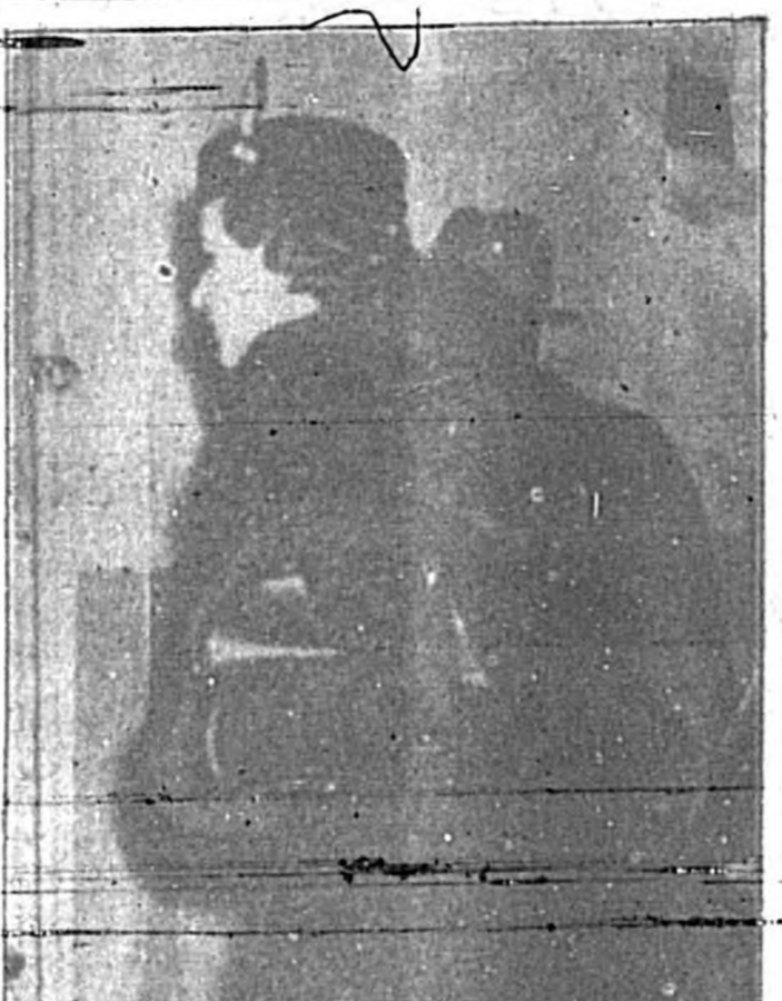
Ready to take the witness stand.