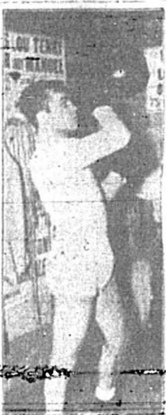
Barney in training.