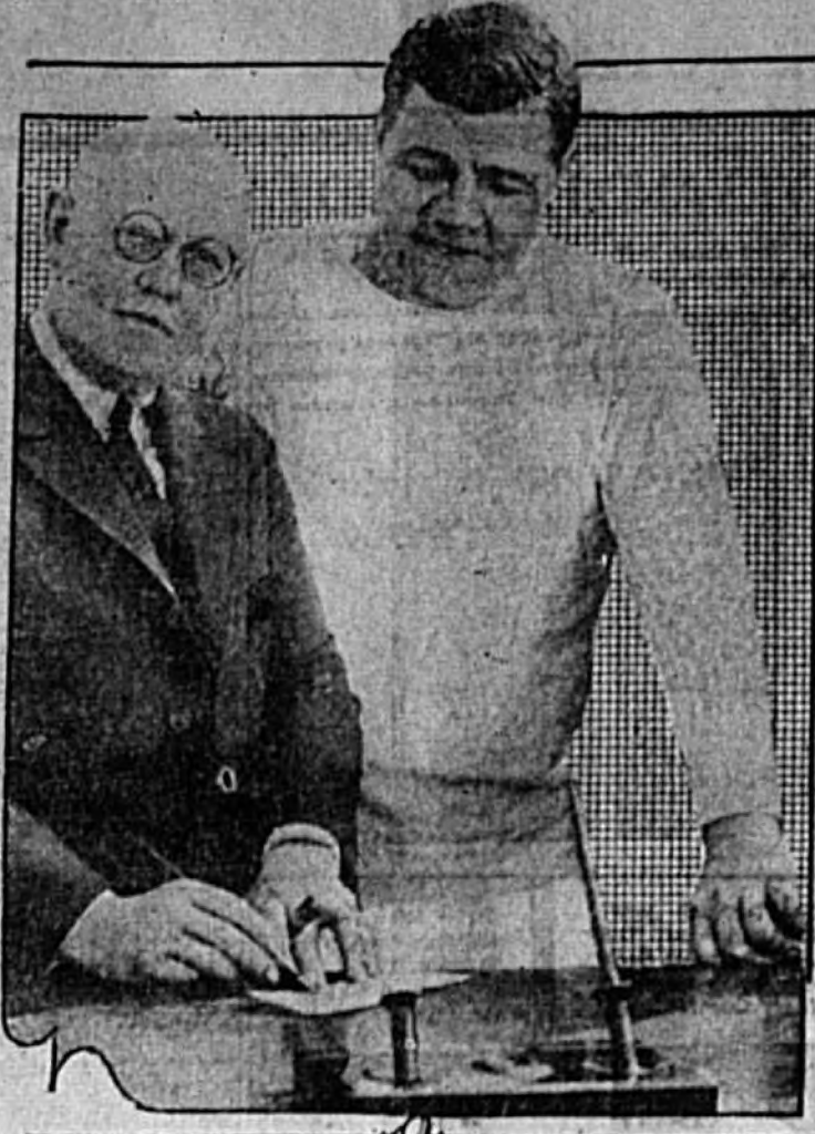
Here we have Babe Ruth in a new role, receiving his first check on a movie contract recently signed. He is to be starred in a baseball picture with Anna Q. Nilsson, the title of which is "Babe Comes Home."