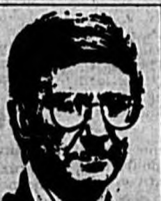
Clayton Williams roared out of West Texas on a wave of his own money.

Six of the ten largest Texas cities have women mayors, and Texas elected a woman governor in 1924. It is too soon to say Texas will not elect another in 1990. Both Williams and Richards are mistake-prone, but she is the more experienced campaigner, and has the majority with her on the abortion issue. (She is pro-choice; he has been emphatically right-to-life, but probably is about to get blurry on that subject.)