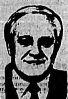
Whistleblowers still put their jobs on the firing line.

Not since Teddy Roosevelt has an American president turned the White House into a bully pulpit for a whistleblower's cause. Faced with a Navy lieutenant who claimed he was not being promoted because of his repeated warnings about the vulnerability of our battleships, Roosevelt promoted the man to admiral.